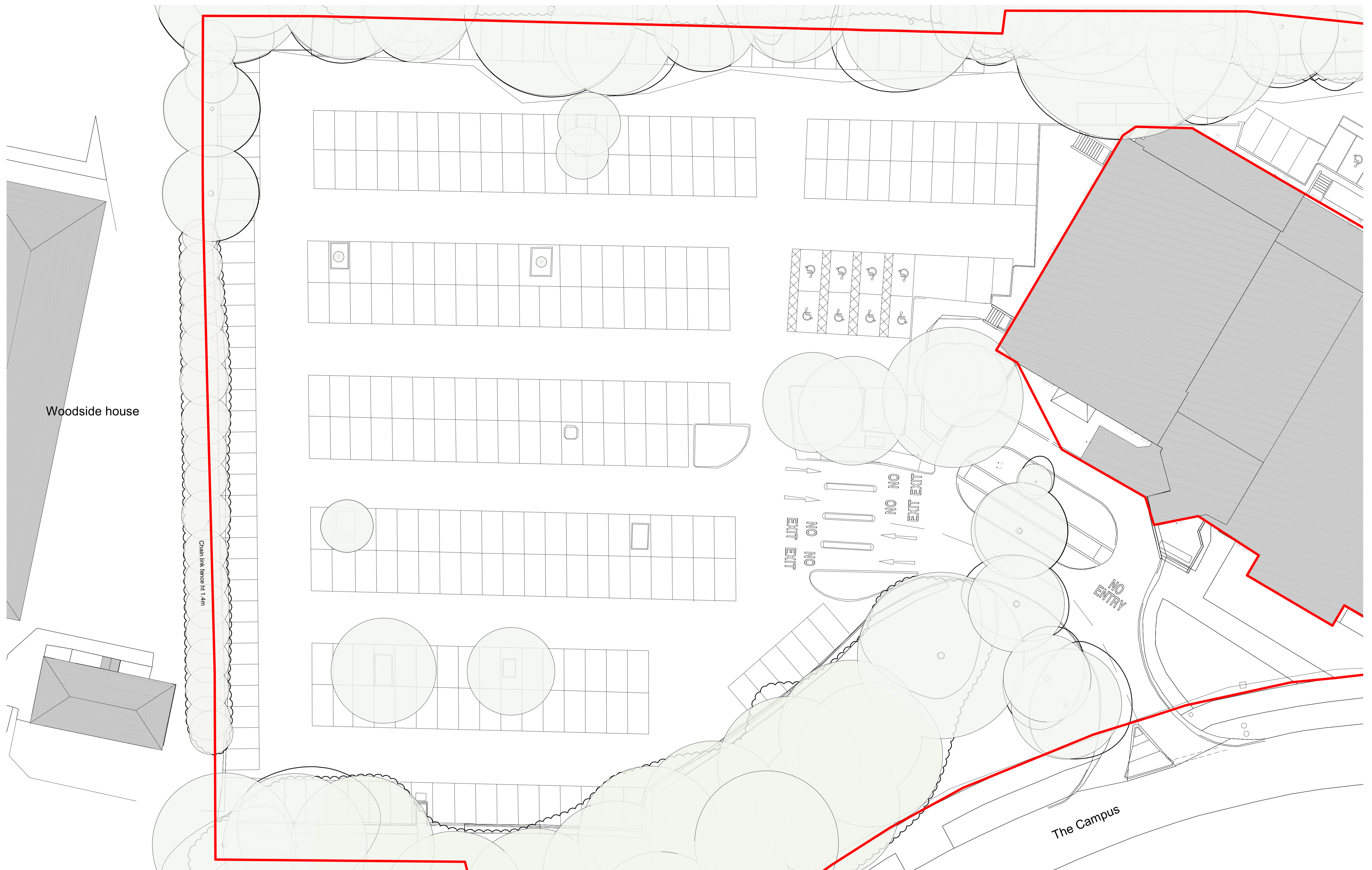
1 Existing ground floor plan P004 Scale - 1 : 200

Notes: All drawings are subject to Planning and Building Control consent. The details shown are for design intent purposes only and are subject to further design development with suppliers and sub-contractors Proposals subject to consultation and approval from Local Authority Building Control or an Approved Inspector All setting out dimensions should be checked on-site prior to construction and any discrepancies and/or omissions should be reported to the Architect immediately