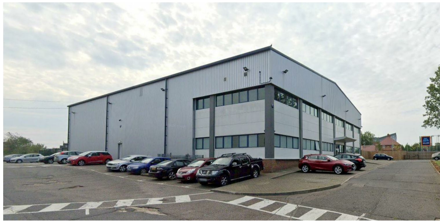
1 View from front of the building