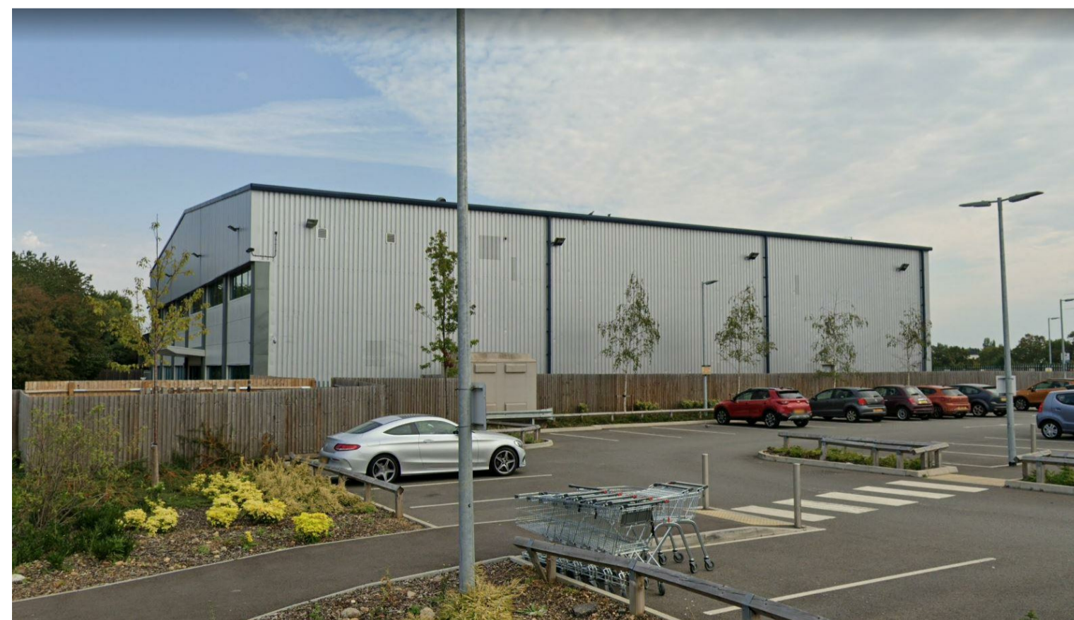
4 View from south side of the building where new windows are proposed to be installed