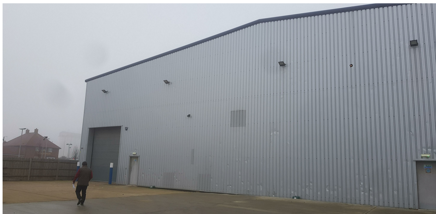
3 View from back of the building where new windows & shutter are proposed to be installed