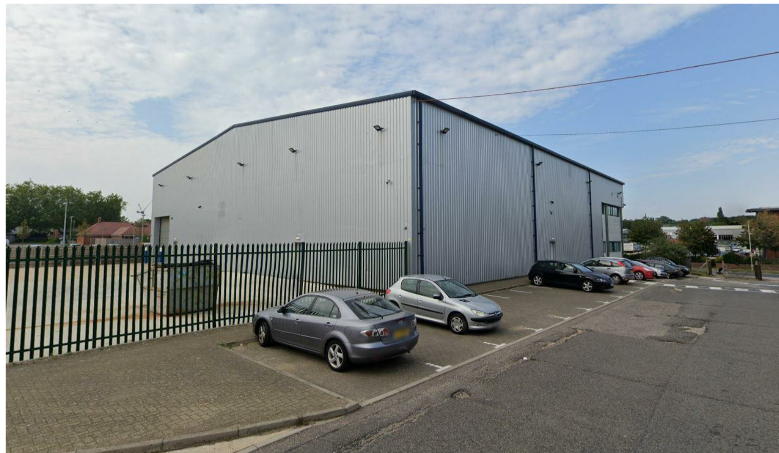
2 View from side of the building where new windows & shutter are proposed to be installed