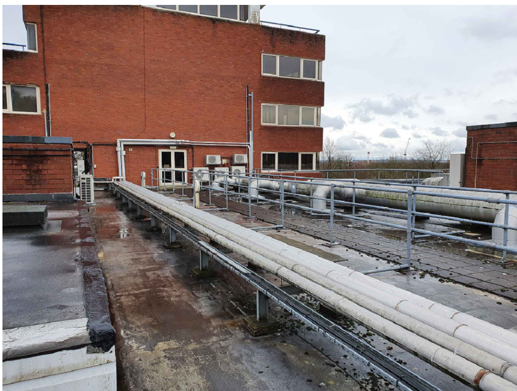
EXISTING ROOF MOUNTED SERVICES