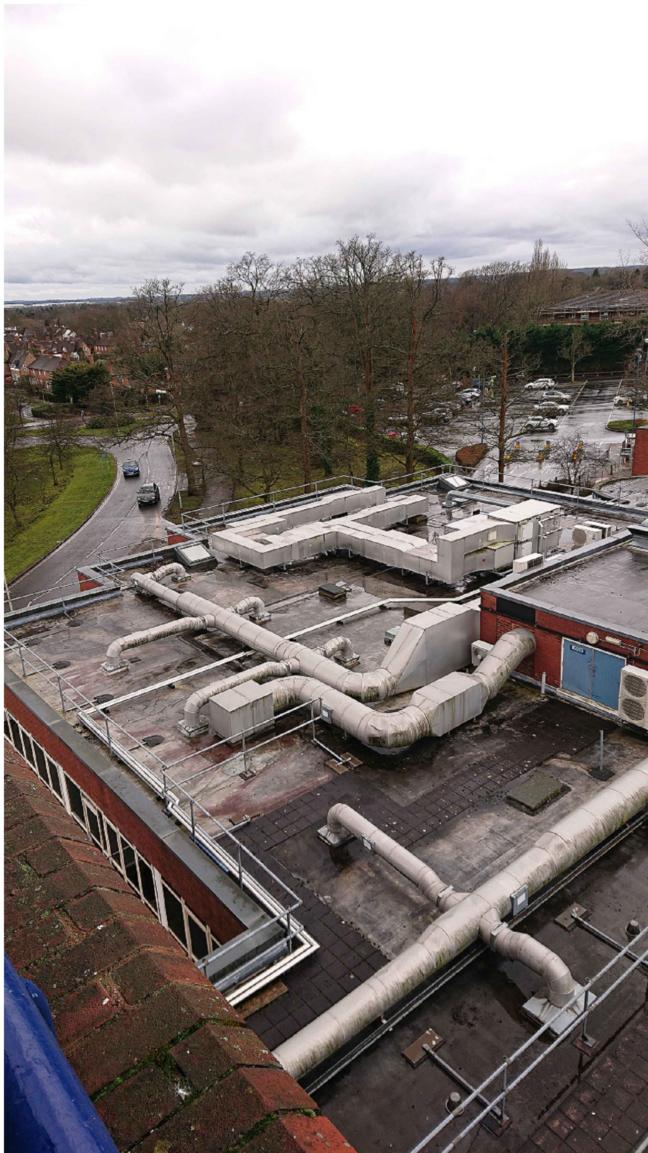
EXISTING ROOF MOUNTED PLANT AND EQUIPMENT