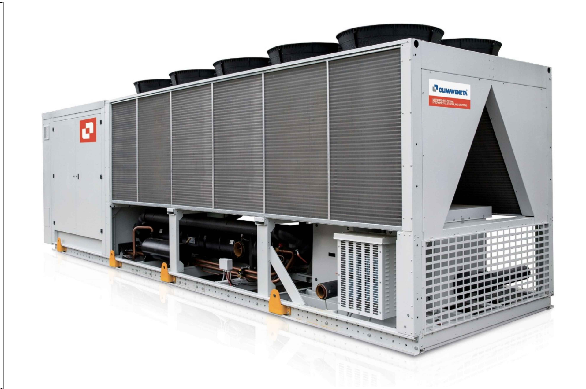
PROPOSED NEW ROOF CHILLER

COPYRIGHT © FIGURED DIMENSIONS ONLY ARE TO BE USED. FOR OTHER DIMENSIONS REFER TO CA. ALL DIMENSIONS TO BE CHECKED ON SITE PRIOR TO THE COMMENCEMENT OF WORK. DISCREPANCIES, AMBIGUITIES OR DIFFERENCES BETWEEN DRAWINGS, AND BETWEEN DRAWINGS AND SPECIFICATION OR BILLS OF QUANTITIES TO BE REFERRED TO CA WITHOUT DELAY.