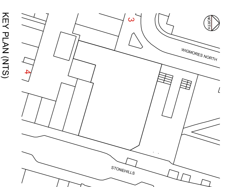
KEY PLAN (NTS)