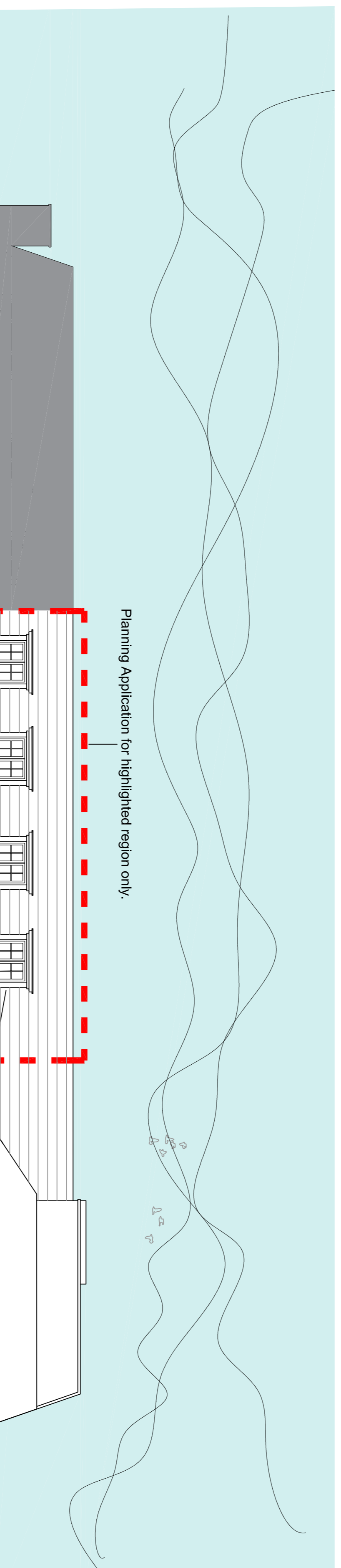
ELEVATION 4 (SOUTH ELEVATION)