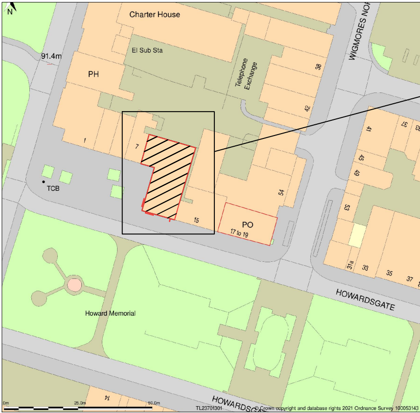
Plan View Scale 1:1250