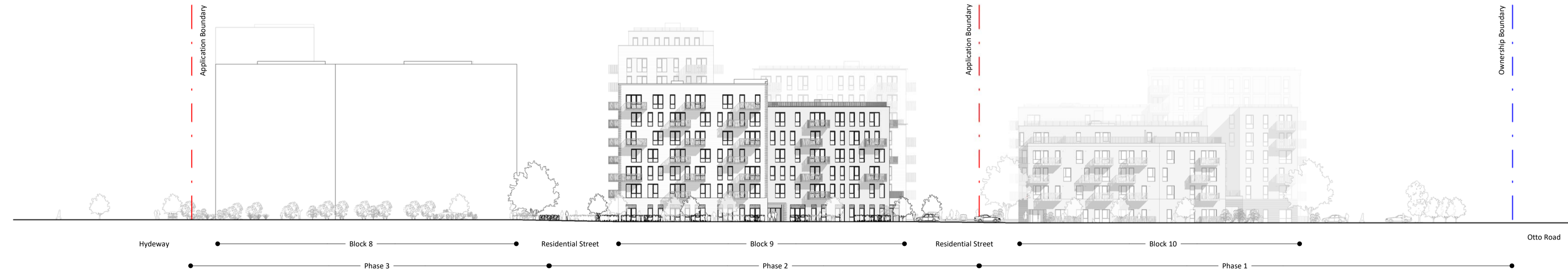
3 Site Elevation - Through Weave F 1 : 500 @A1

NOTES CONSULTANTS - Refer to highways consultant's drawings for details - Refer to landscape consultant's drawings for details - Landscaping layout is indicative only AREAS - Refer to area schedule © Copyright Reserved. ColladoCollins Architects Ltd.