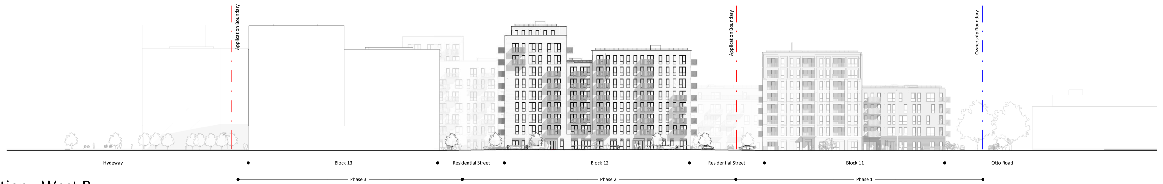
2 Site Elevation - West B 1 : 500 @A1