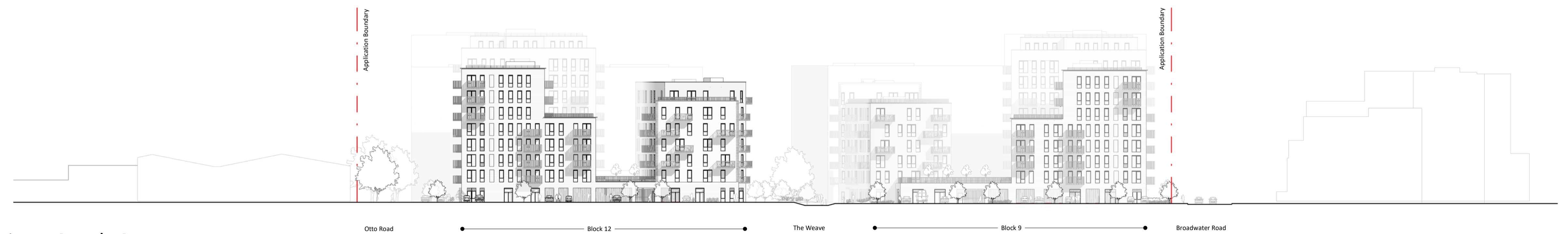
3 Site Elevation - South C 1 : 500 @A1

NOTES CONSULTANTS - Refer to highways consultant's drawings for details - Refer to landscape consultant's drawings for details - Landscaping layout is indicative only AREAS - Refer to area schedule © Copyright Reserved. ColladoCollins Architects Ltd.