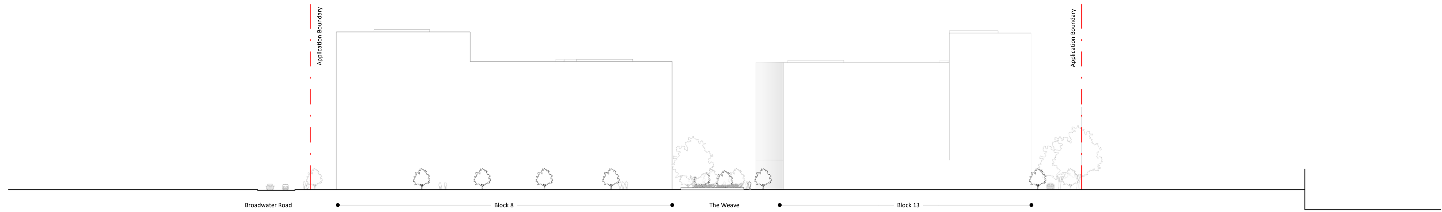
1 Site Elevation - North A - Hydeway Elevation 1 : 500 @A1