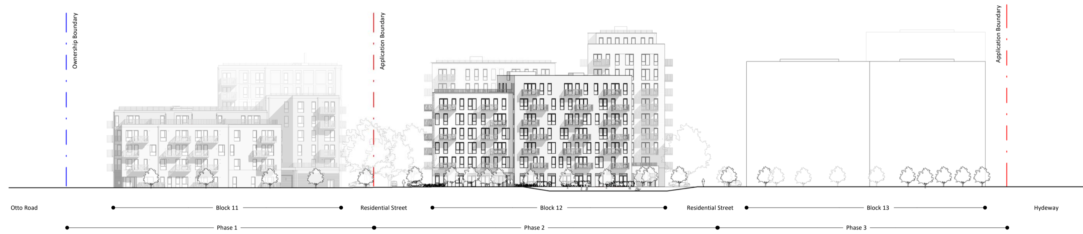
2 Site Elevation - Through Weave E 1 : 500 @A1