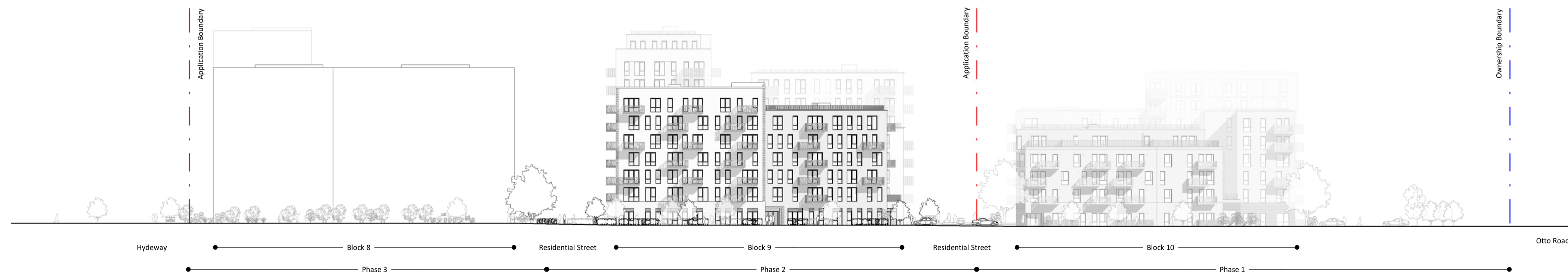
3 Site Elevation - Through Weave F 1 : 500 @A1

NOTES CONSULTANTS - Refer to highways consultant's drawings for details - Refer to landscape consultant's drawings for details - Landscaping layout is indicative only AREAS - Refer to area schedule © Copyright Reserved. ColladoCollins Architects Ltd.