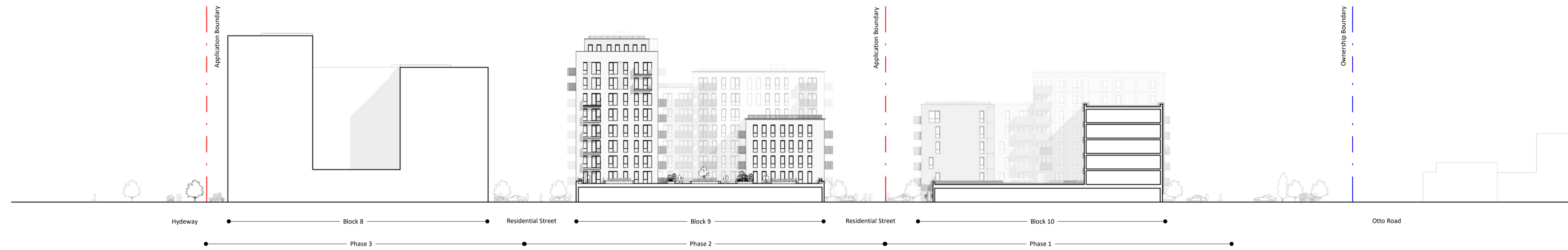
1 Section - L 1 : 500 @A1