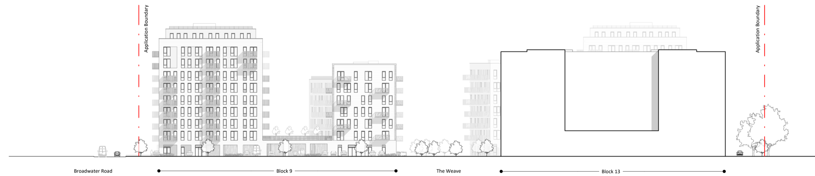
2 Section - M 1 : 500 @A1

NOTES CONSULTANTS - Refer to highways consultant's drawings for details - Refer to landscape consultant's drawings for details - Landscaping layout is indicative only AREAS - Refer to area schedule © Copyright Reserved. ColladoCollins Architects Ltd.