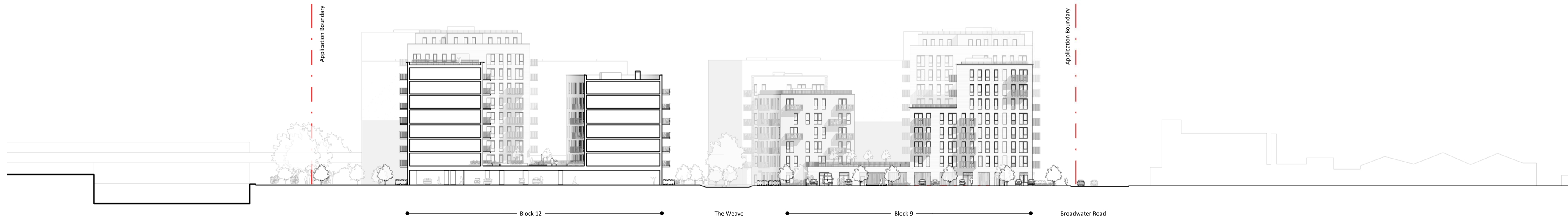
2 Section - K 1 : 500 @A1

NOTES CONSULTANTS - Refer to highways consultant's drawings for details - Refer to landscape consultant's drawings for details - Landscaping layout is indicative only AREAS - Refer to area schedule © Copyright Reserved. ColladoCollins Architects Ltd