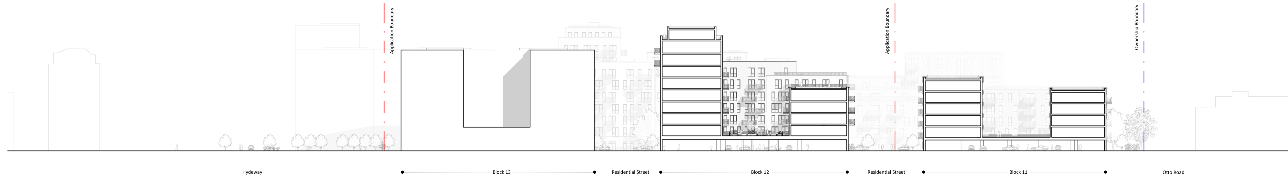
1 Section - J 1 : 500 @A1