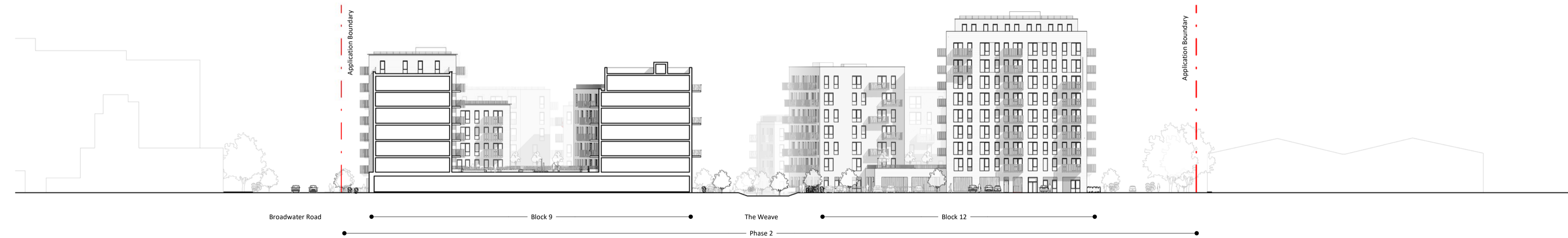
2 Section - H 1 : 500 @A1

NOTES CONSULTANTS - Refer to highways consultant's drawings for details - Refer to landscape consultant's drawings for details - Landscaping layout is indicative only AREAS - Refer to area schedule