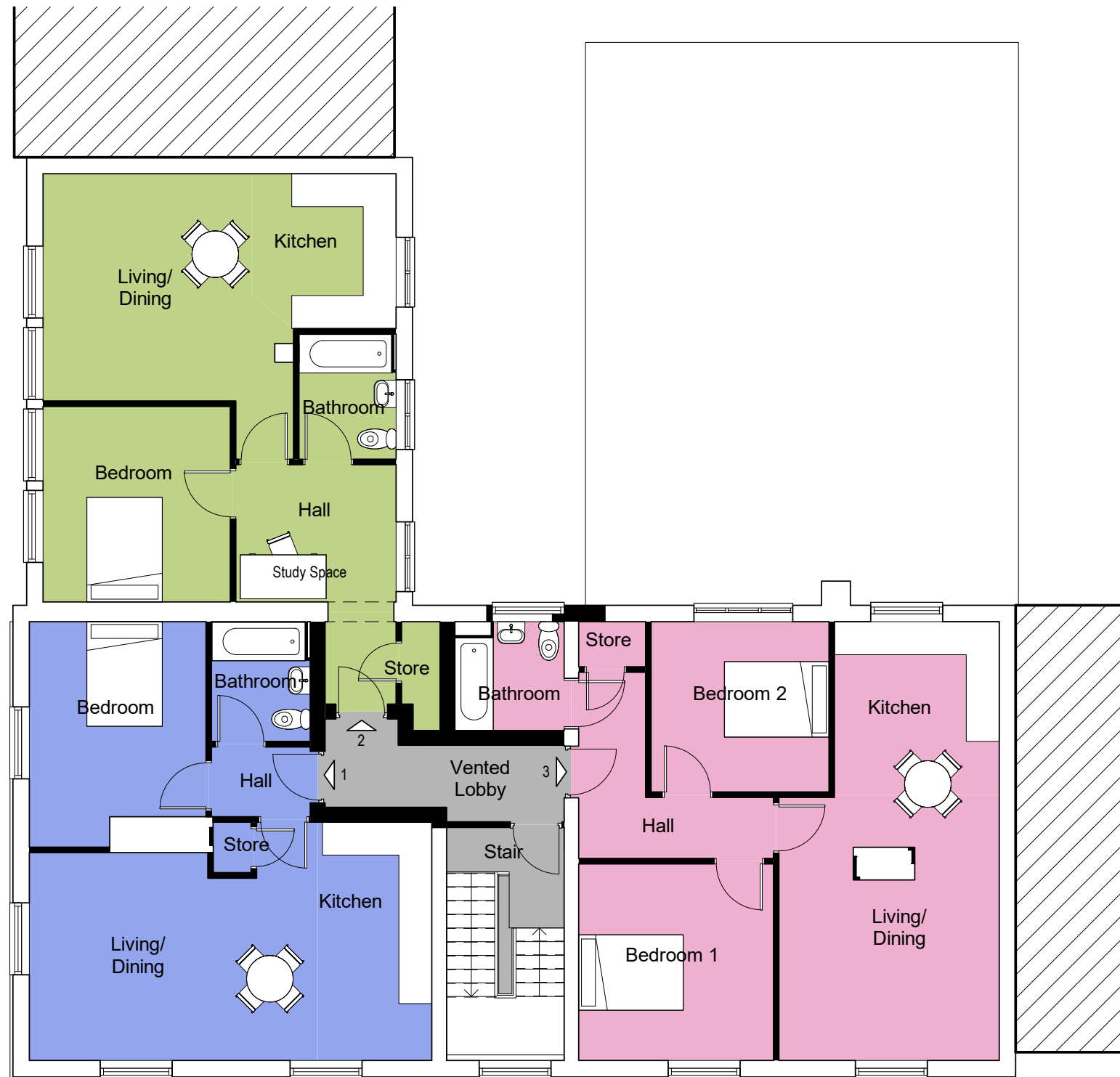
Proposed First Floor 1 : 100

PENTANGLE DESIGN GROUP SUITE 1, 21 BANCROFT HITCHIN HERTS SG5 1JW T:01462 431133 E:pdg@pentangledesign.co.uk