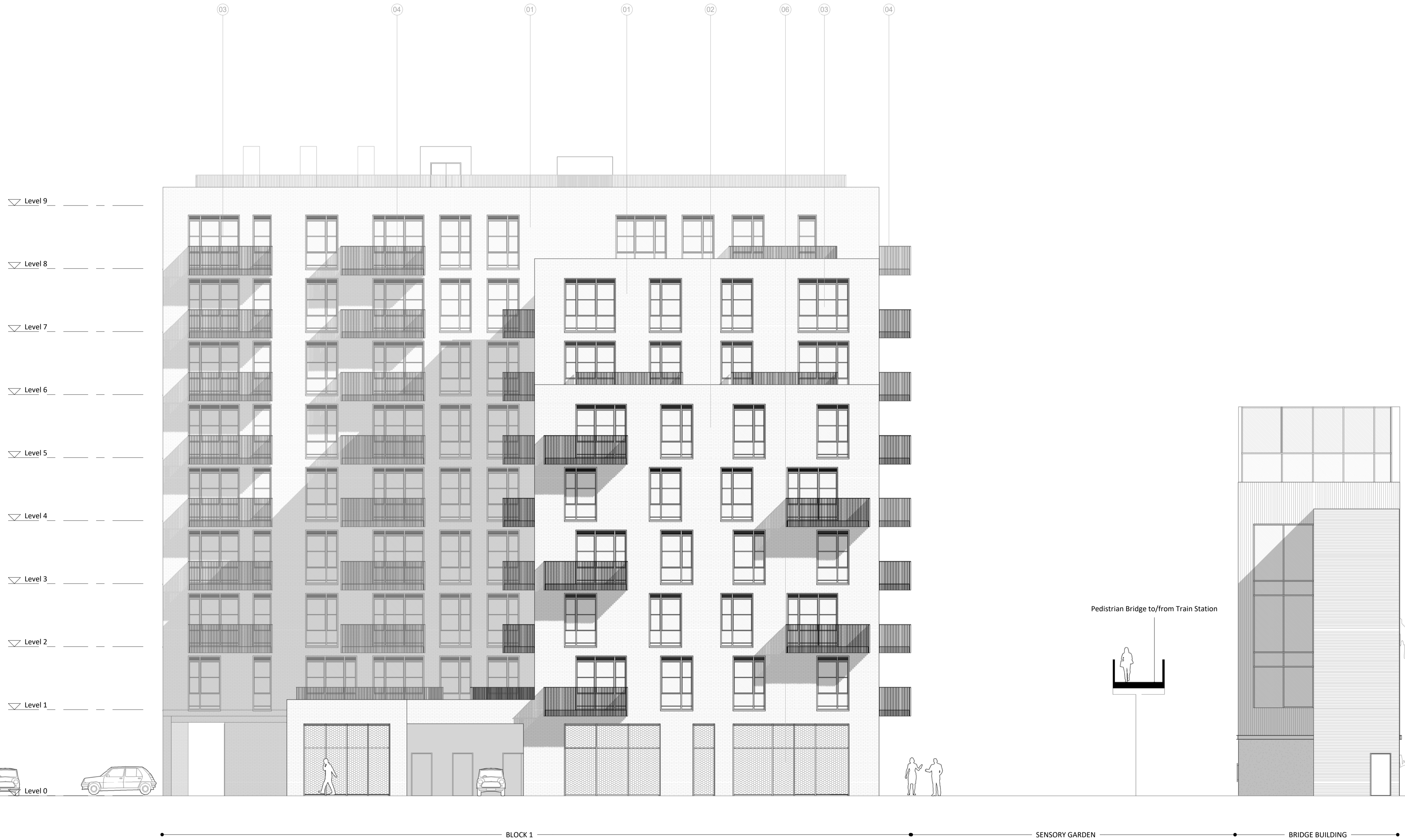
1 North West Elevation 1 : 100