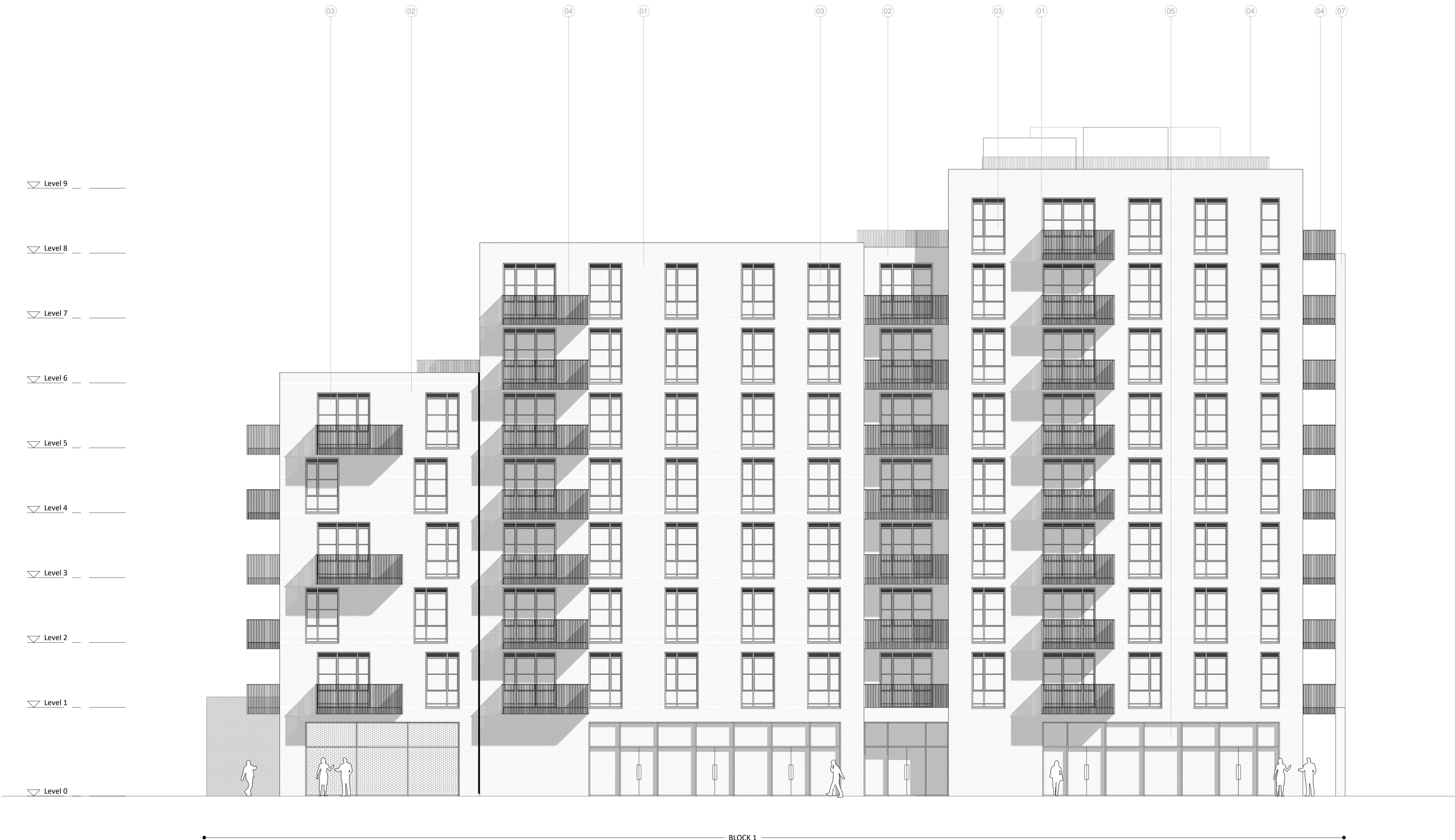
1 South West Elevation 1 : 100

NOTES CONSULTANTS - Refer to highways consultant's drawings for details - Refer to landscape consultant's drawings for details - Landscaping layout is indicative only AREAS - Refer to area schedule © Copyright Reserved. ColladoCollins Architects Ltd