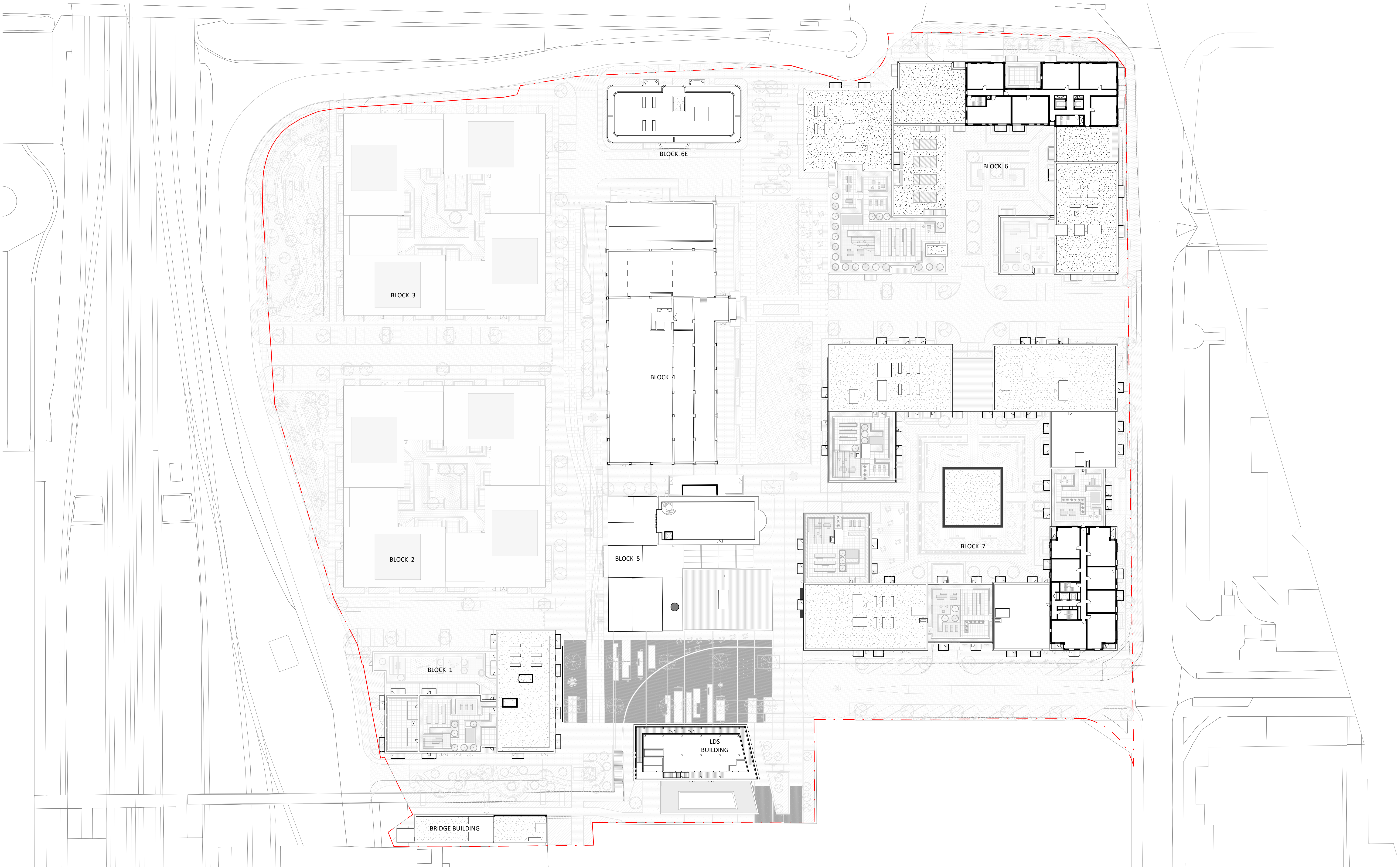
1 Ninth Floor Plan 1 : 500 @A1