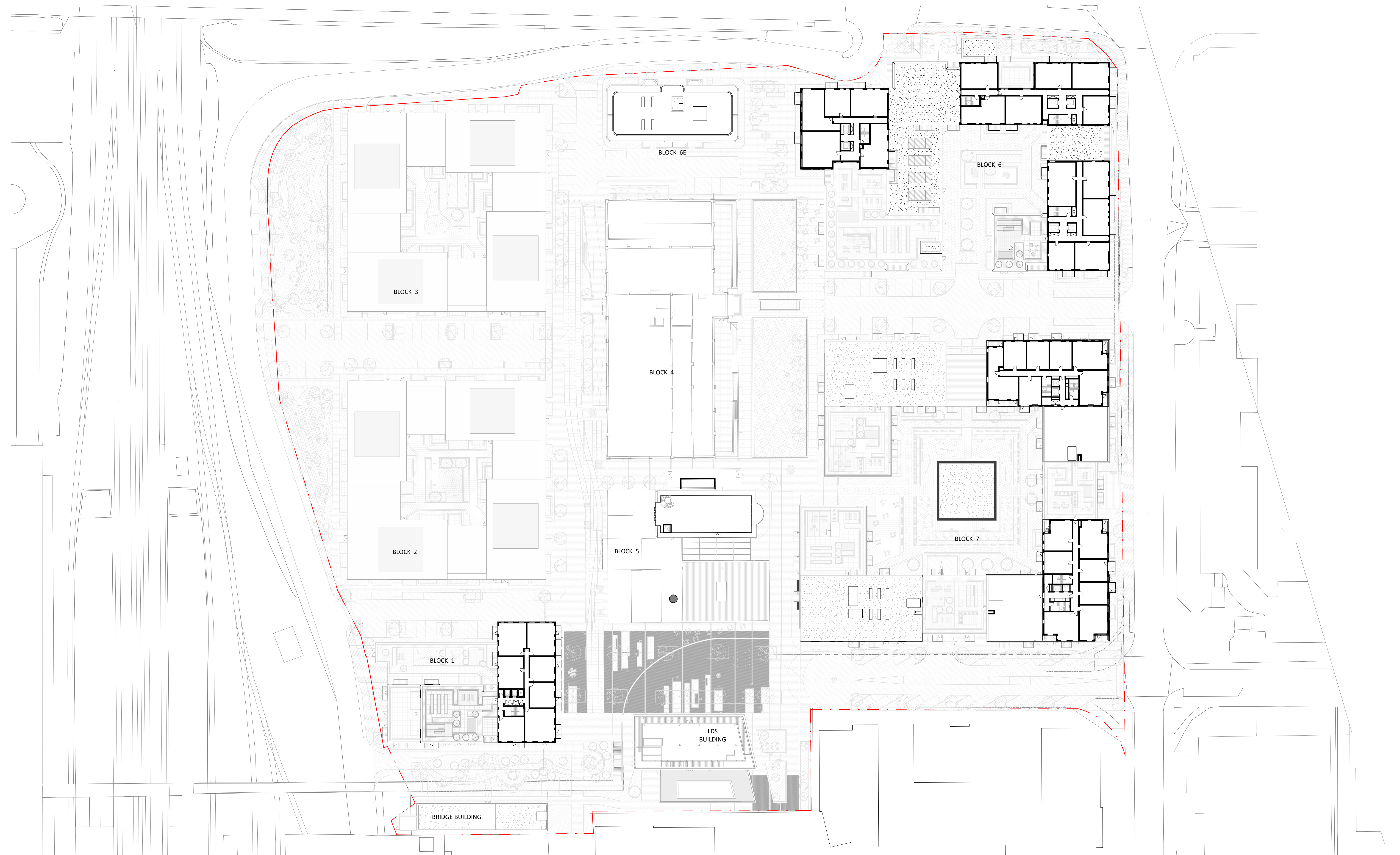
1 Eighth Floor Plan 1 : 500 @A1