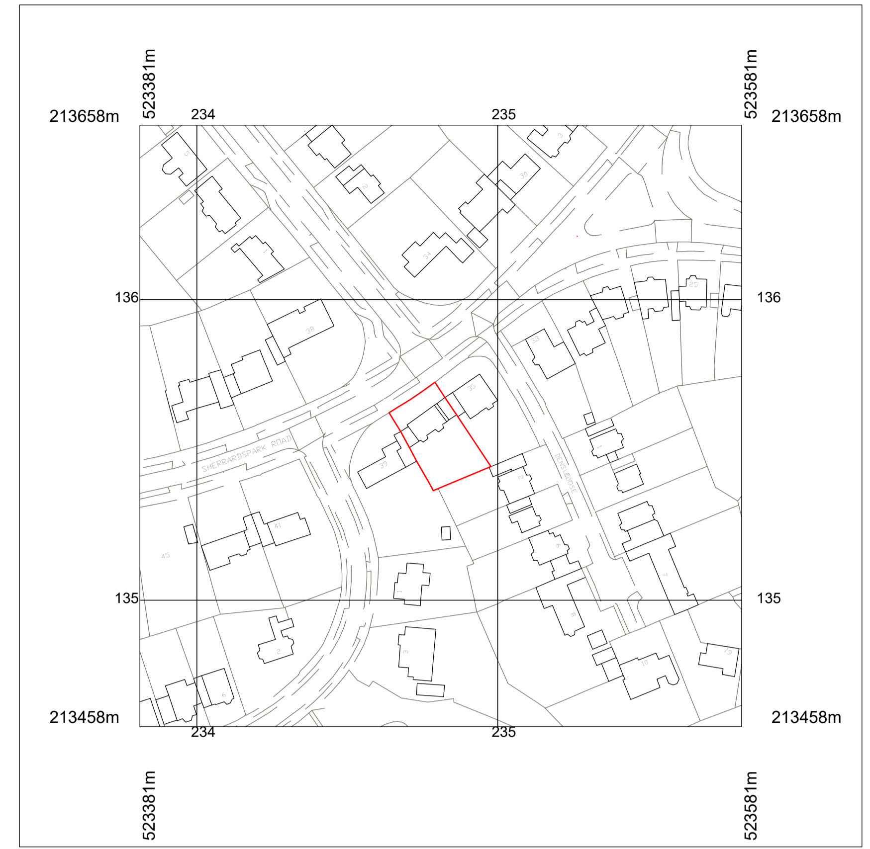
SITE LOCATION PLAN 1:1250 SCALE