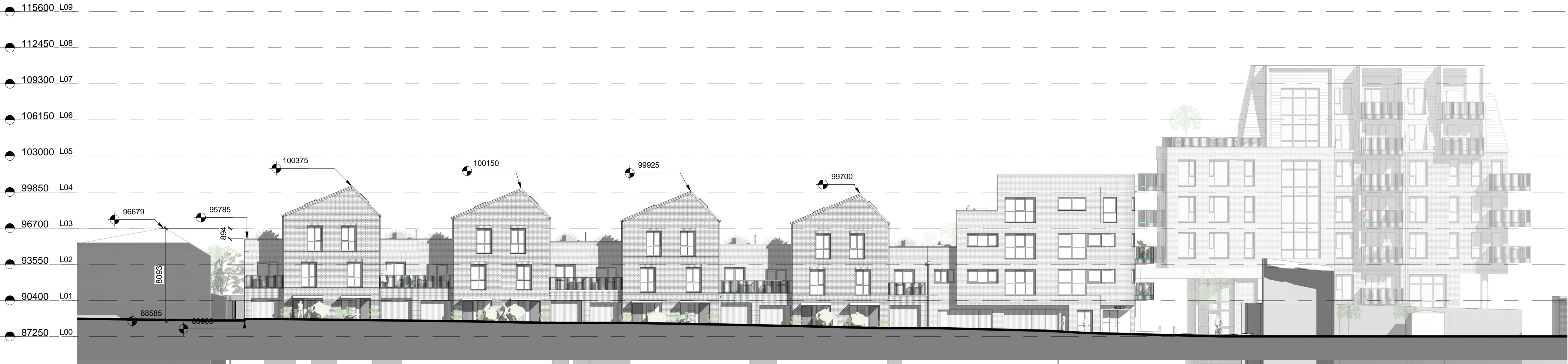
LS-04 1 : 200