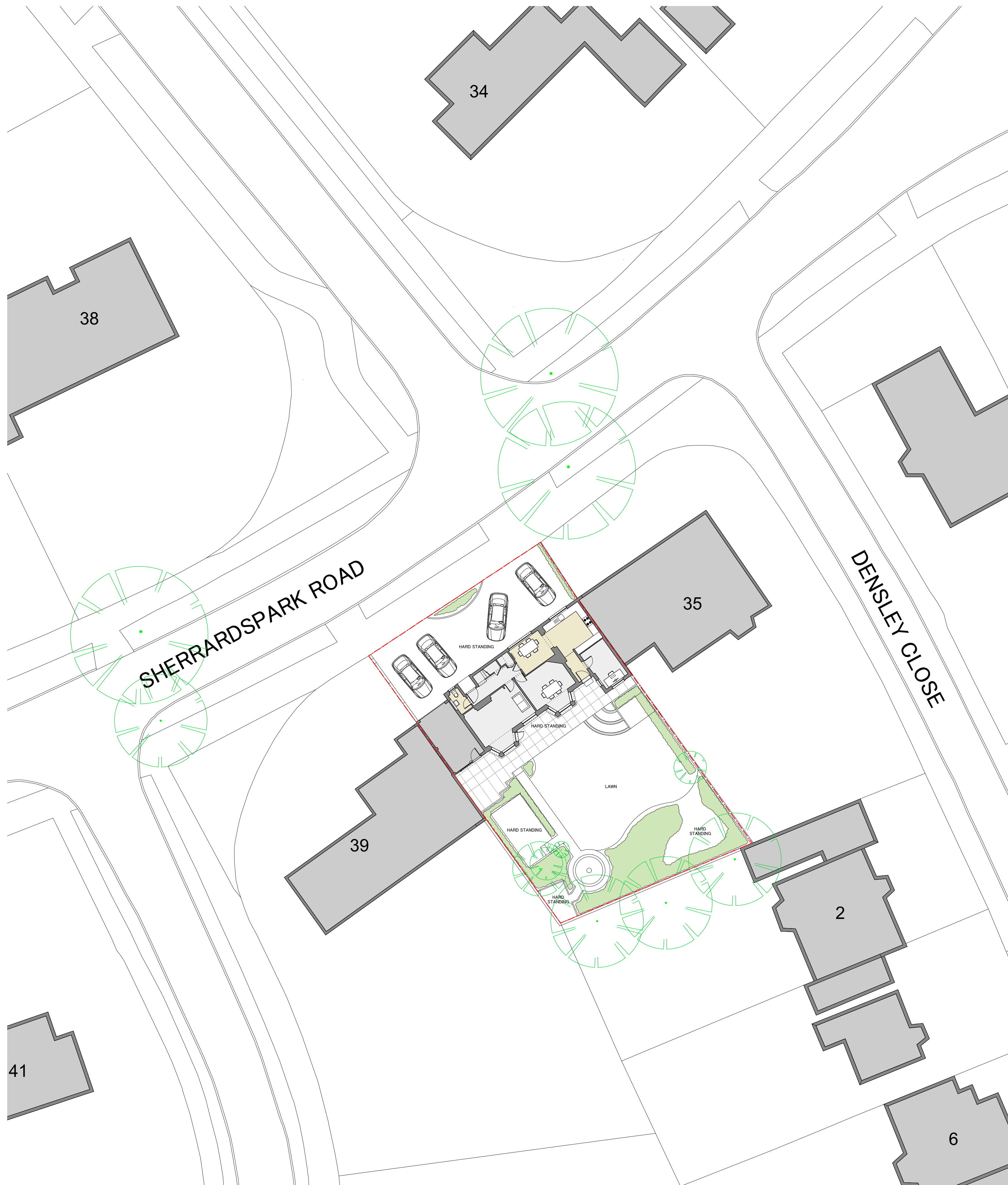
EXISTING SITE PLAN 1:200 SCALE