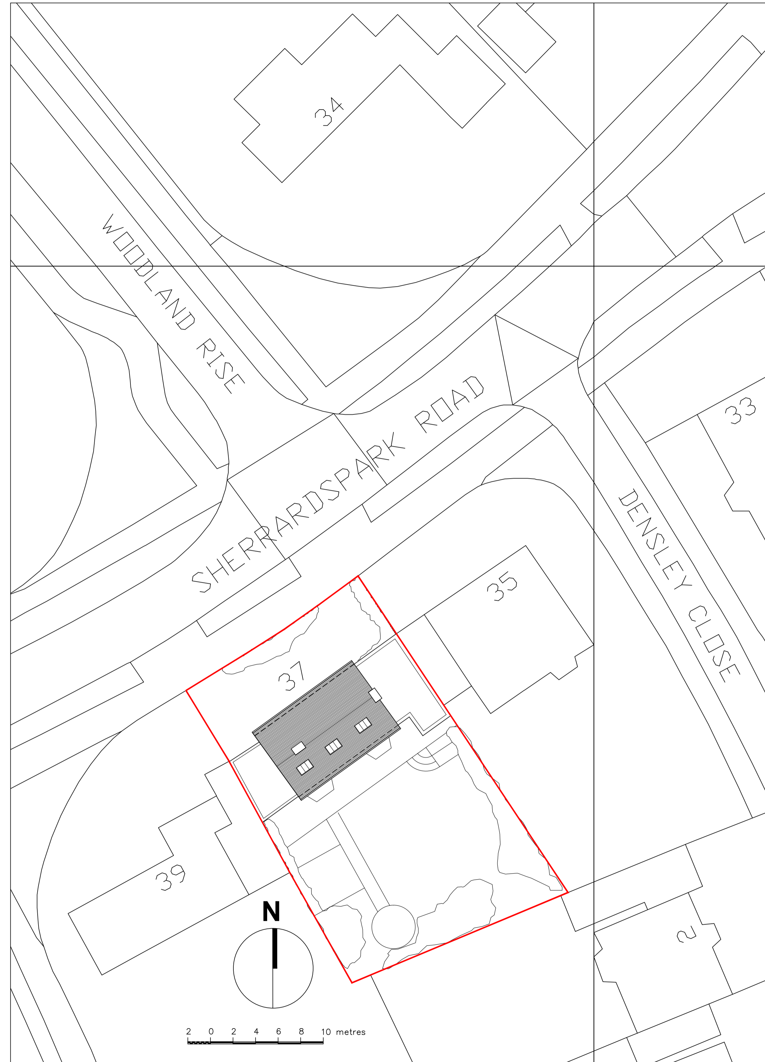
BLOCK PLAN AS EXISTING