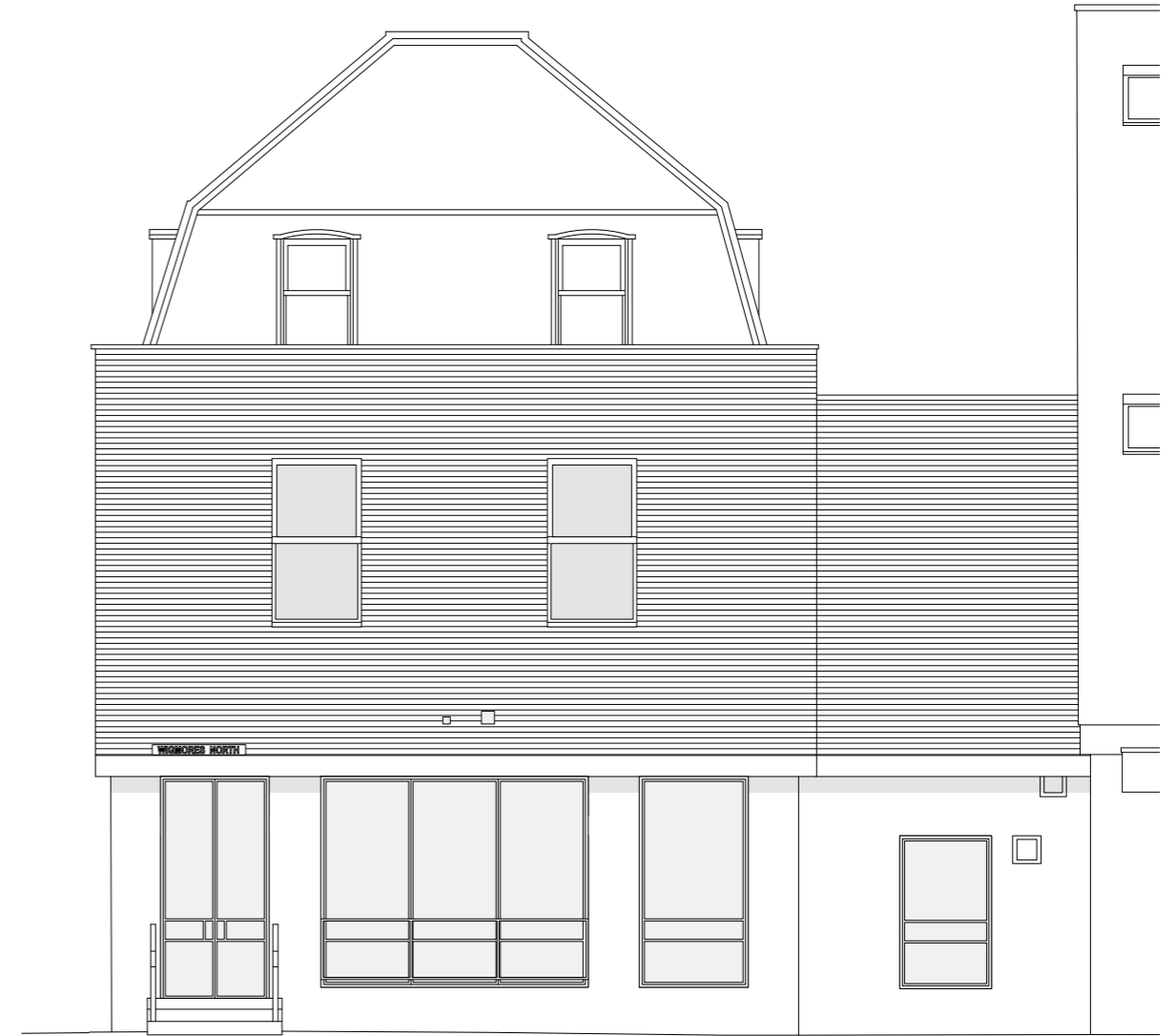
WIGMORES NORTH ELEVATION - 1:50@A1, 1:100@A3