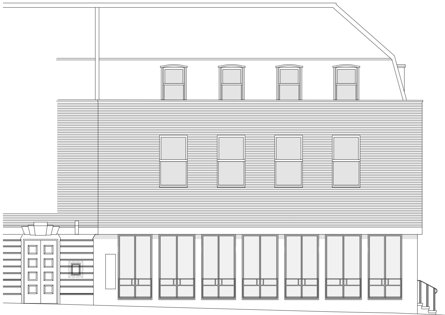
HOWARDSGATE ELEVATION - 1:50@A1, 1:100@A3