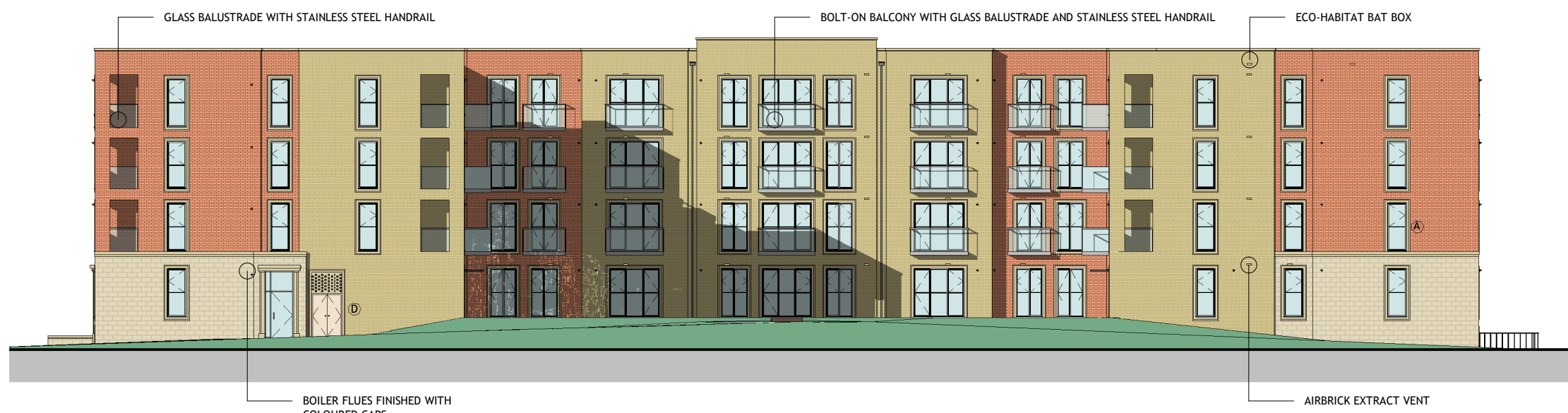
South Elevation 1 : 250