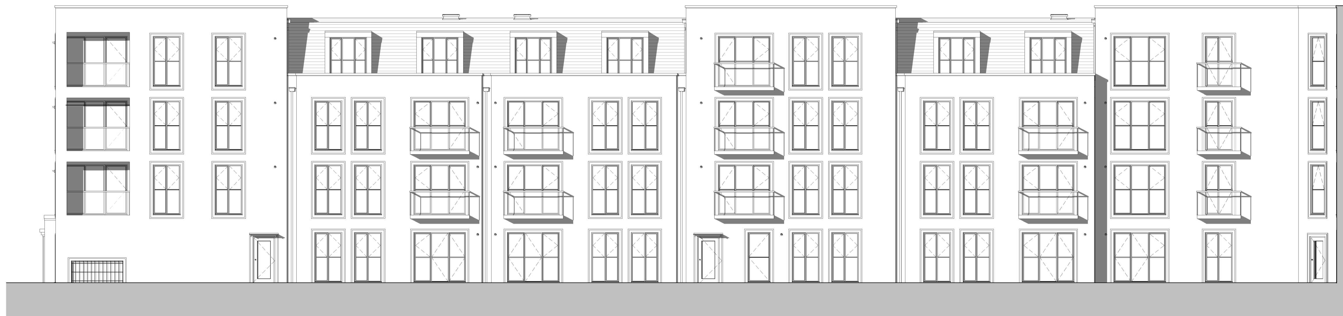
East Elevation - Patio 1 : 100