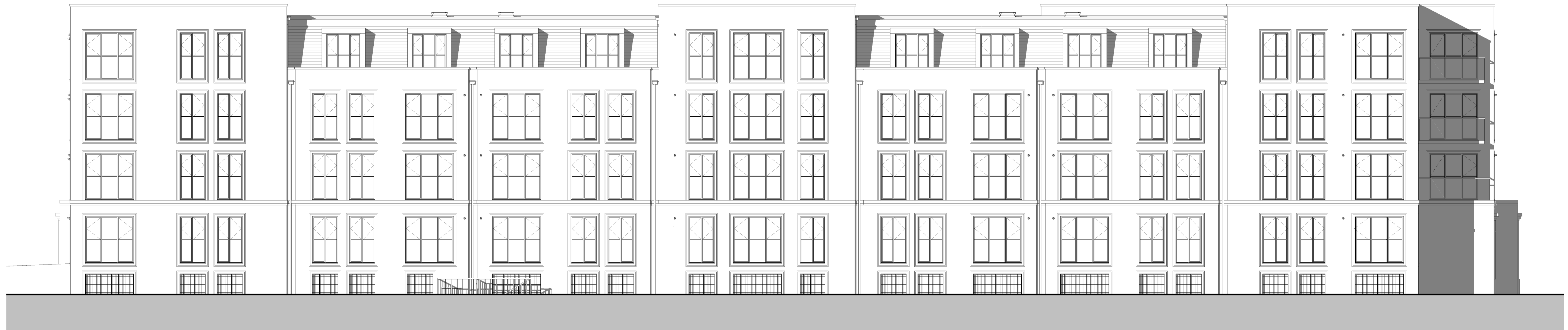
East Elevation 1 : 100