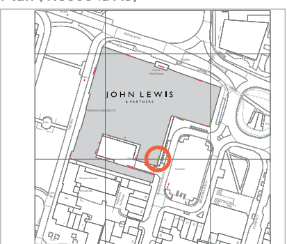
Plan Detail (1:1000 @ A3)