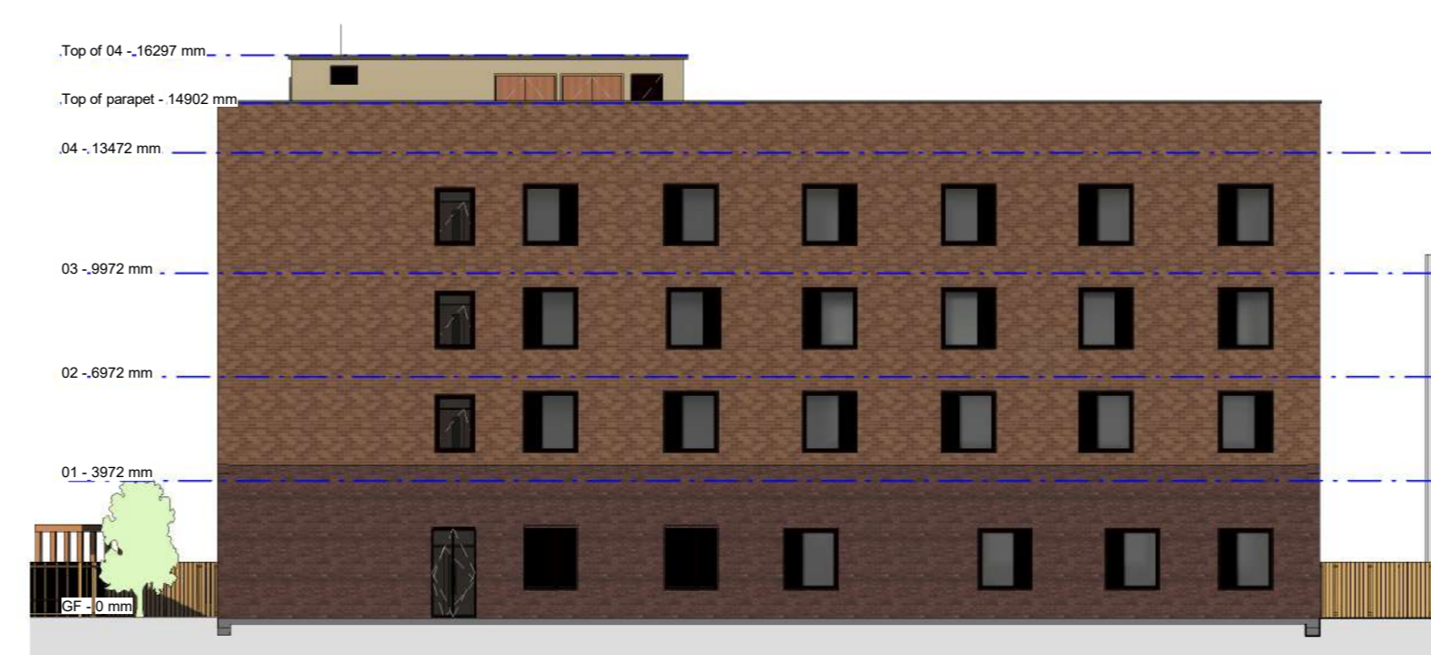
8 SOUTH WEST ELEVATION (PROPOSAL) 1 : 200

C:\Users\Carl\OneDrive\Documents\47-WPA-Z1-EL-DR-A\001_Architectural_C_2022_c.hetz.rvt