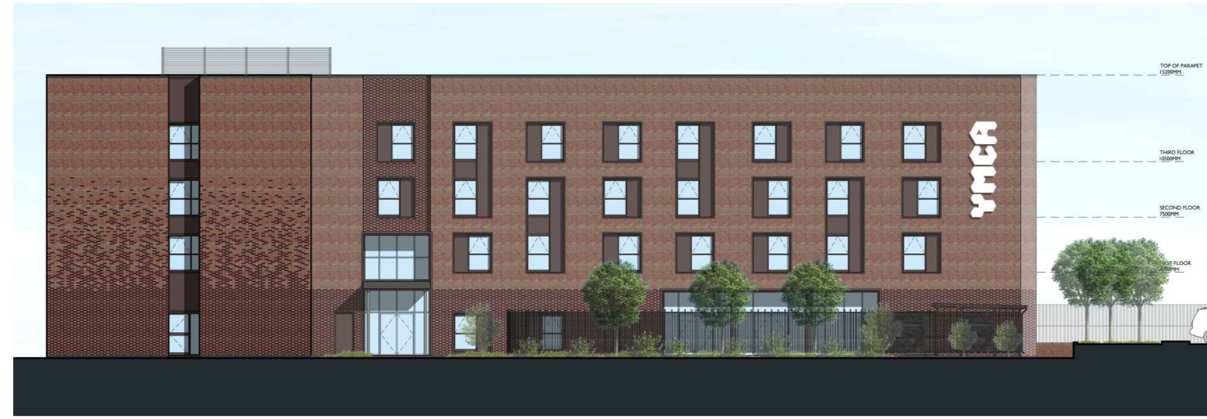
1 NORTH WEST ELEVATION (APPROVED) 1 : 200