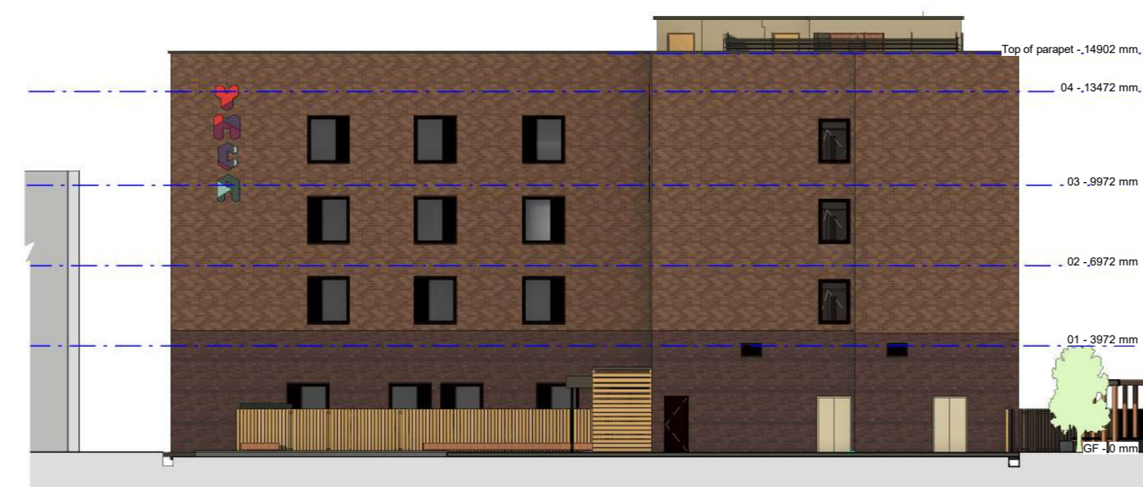
4 NORTH EAST ELEVATION (PROPOSAL) 1 : 200