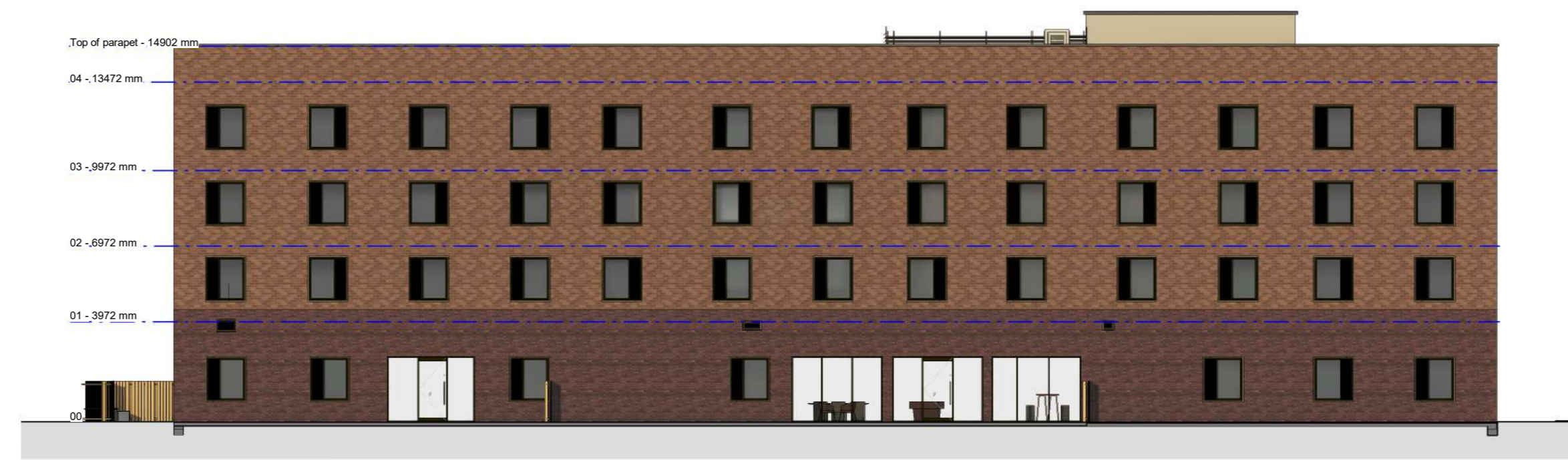
6 SOUTH EAST ELEVATION (PROPOSAL) 1 : 200