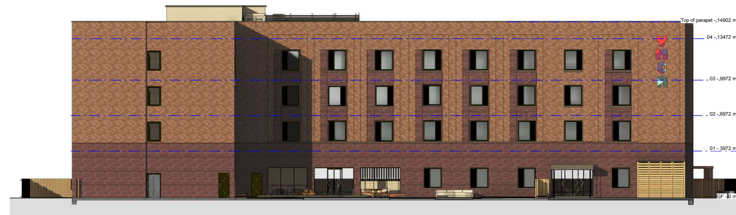
2 NORTH WEST ELEVATION (PROPOSAL) 1 : 200