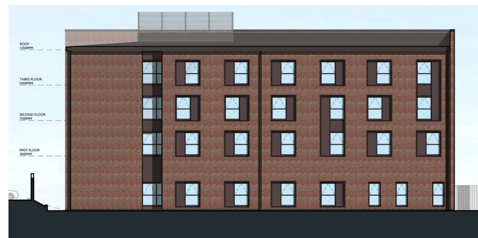
7 SOUTH WEST ELEVATION (APPROVED) 1 : 200