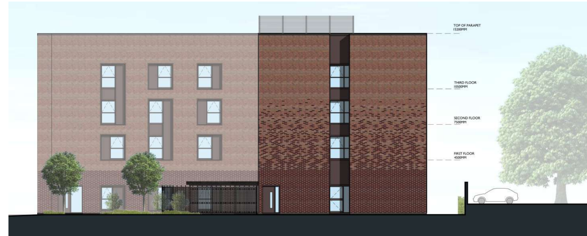
3 NORTH EAST ELEVATION (APPROVED) 1 : 200