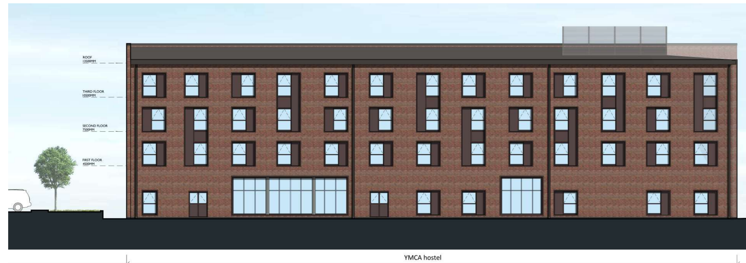
5 SOUTH EAST ELEVATION (APPROVED) 1 : 200