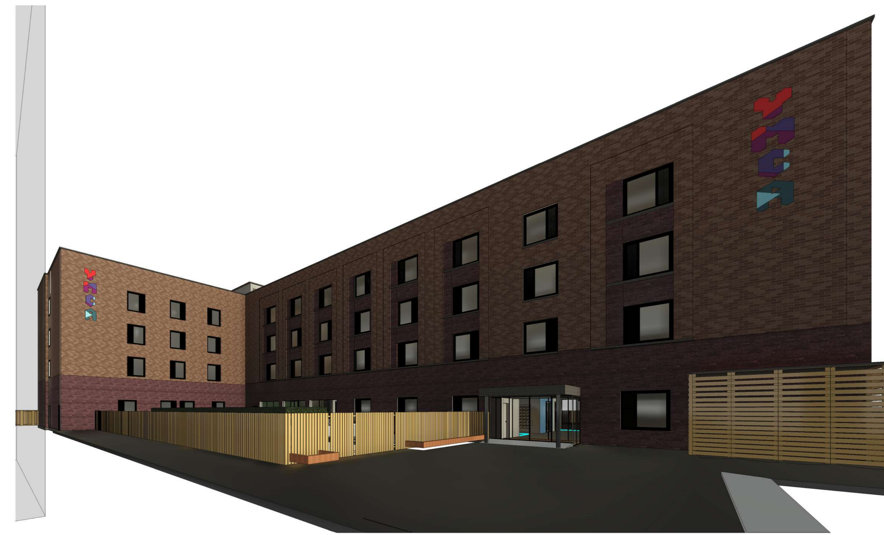
3 3D VIEW 01