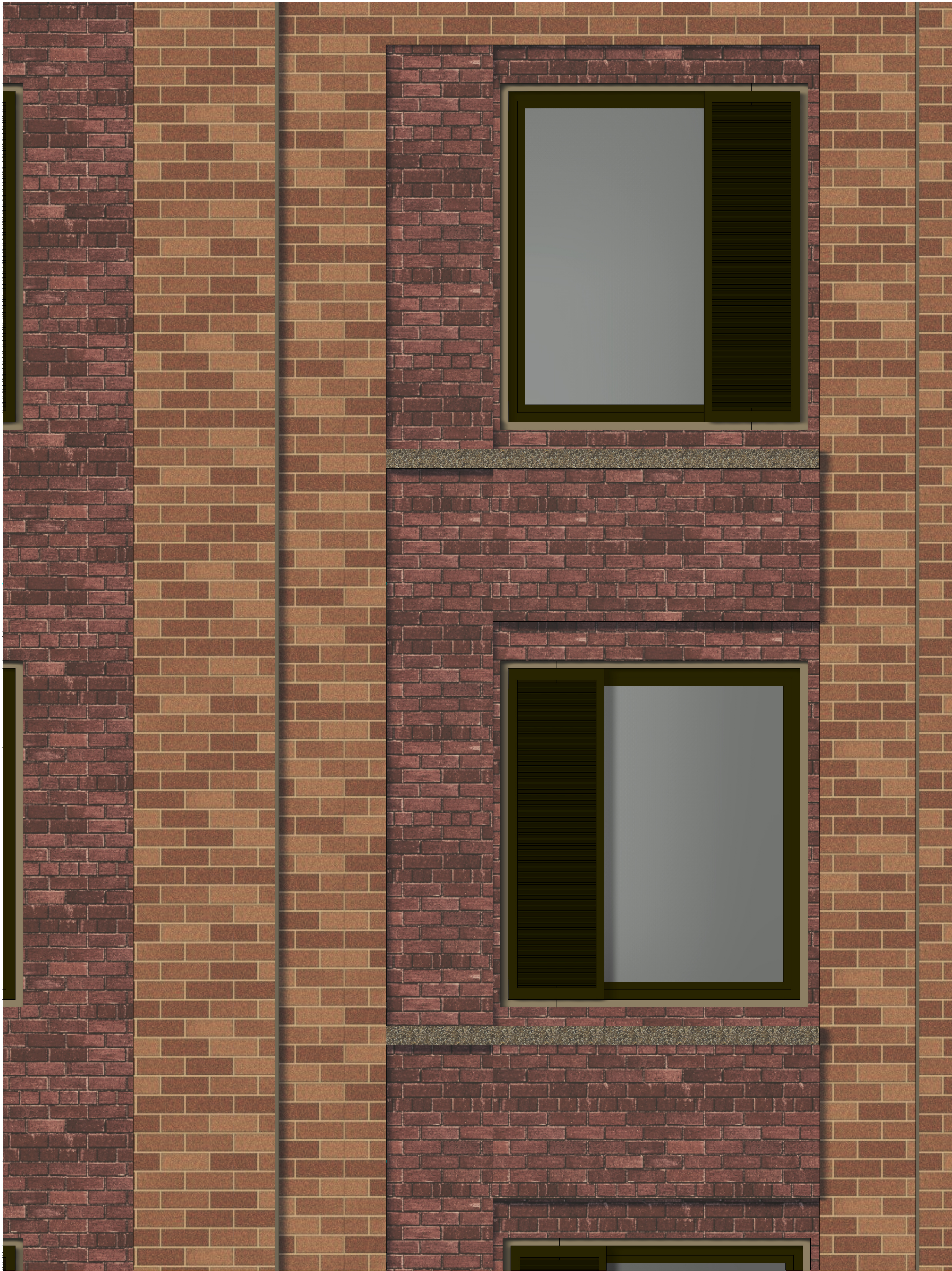
1 TYPICAL WINDOW DETAIL 1 : 10

07/12/2022 17:07:45 P:\Live Project\01\01 ONE YMCA Pear Tree\DESIGN\DRAWINGS\04 Revit Model - 2021 Version\WPA-Z1A-001_Architectural.dwg Project Status Issue Date