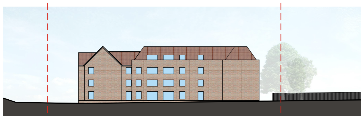
ELEVATION - CC

Block A Block D Block F YMCA hostel (in outline)