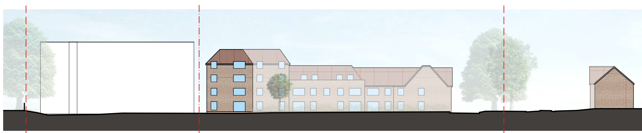
ELEVATION - DD

NOTES This drawing to be read in accordance with the specification/Bills of Quantities and related drawings. No Dimensions to be scaled from this drawing. All stated dimensions to be verified on site and the Architect notified of any discrepancies. Scale bar 50mm at 1:1