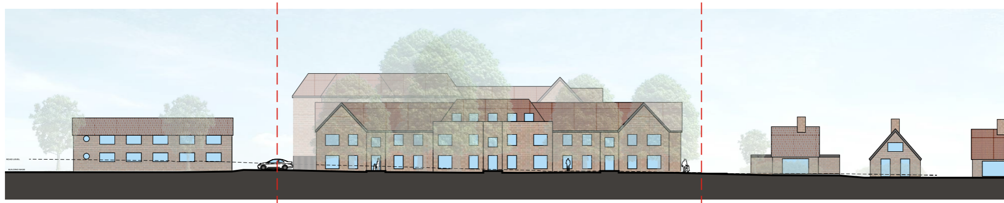
ELEVATION - AA