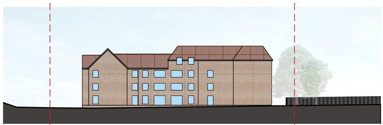
ELEVATION - CC