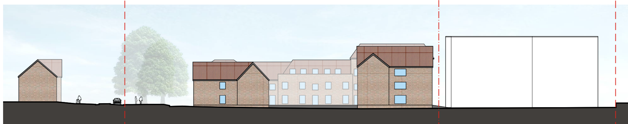
ELEVATION - BB