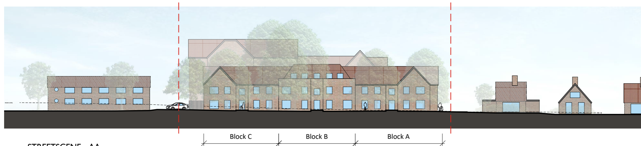
STREETSCENE - AA