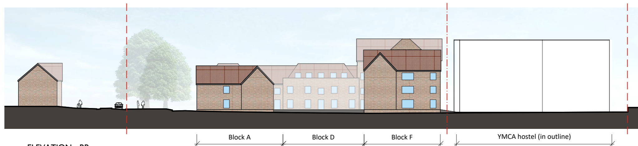
ELEVATION - BB