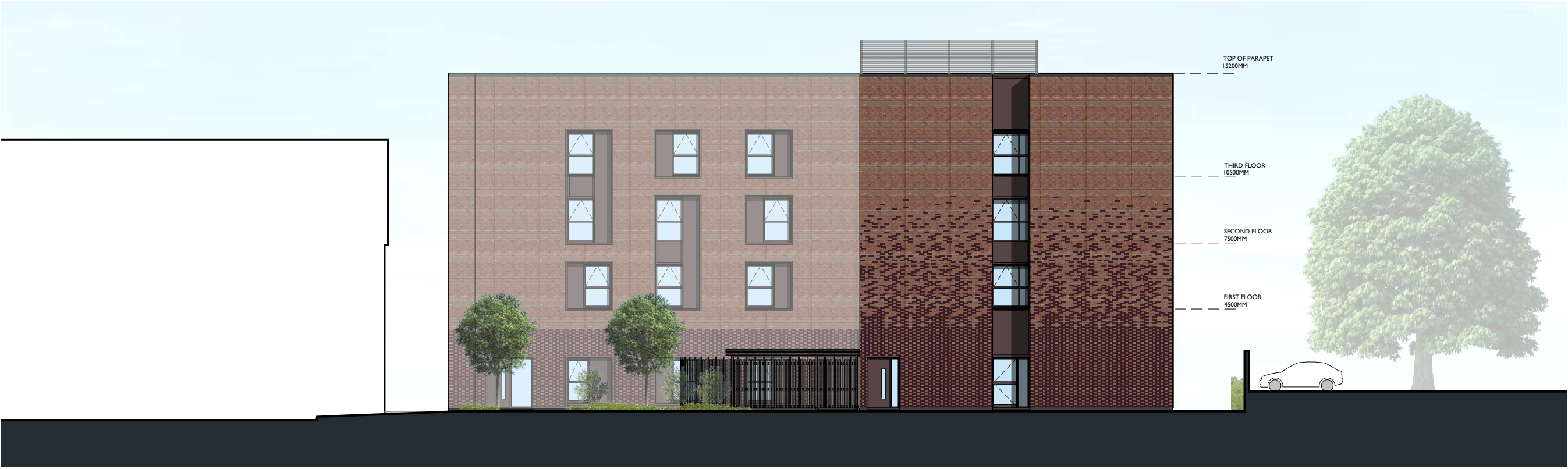
ELEVATION 2 - NORTH Residential development (outline only) YMCA hostel