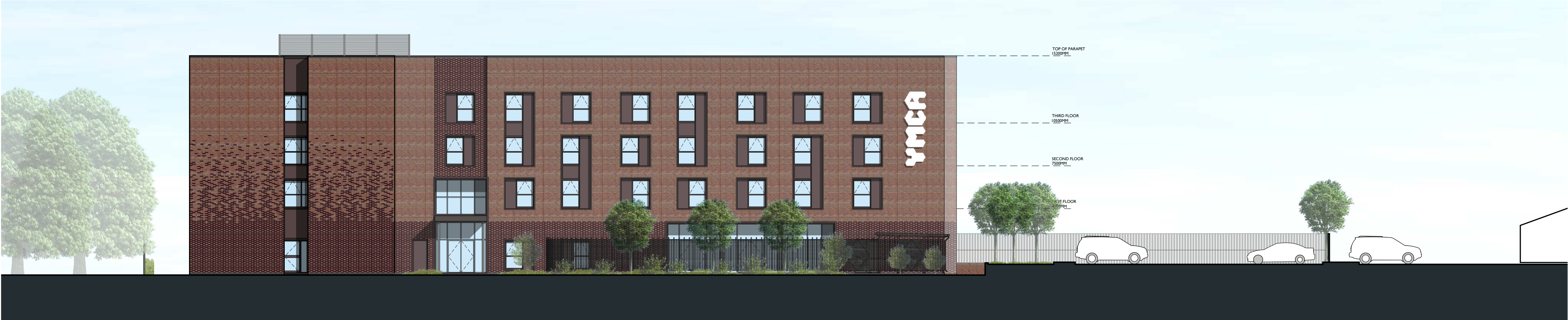
ELEVATION 1 - EAST YMCA hostel Hostel car parking