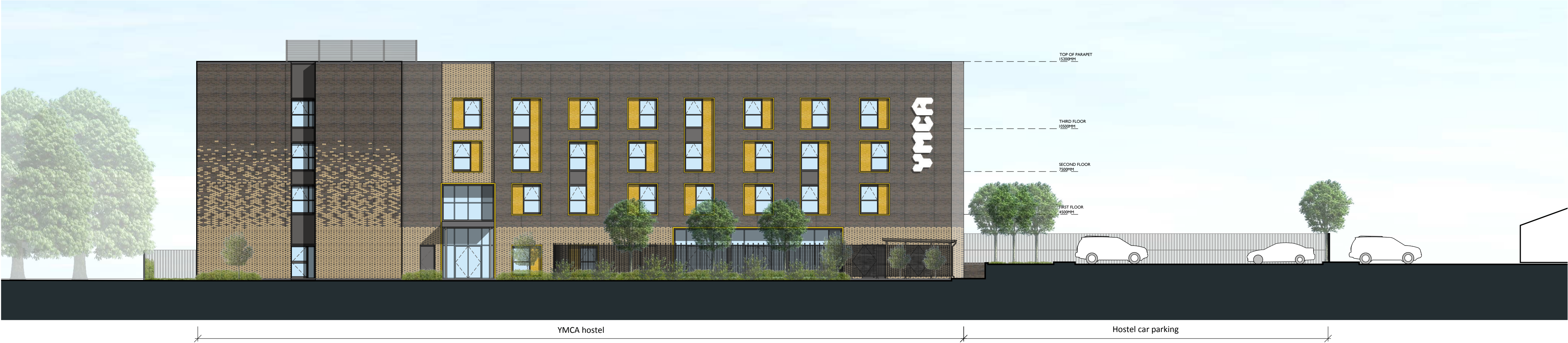
ELEVATION 1 - EAST