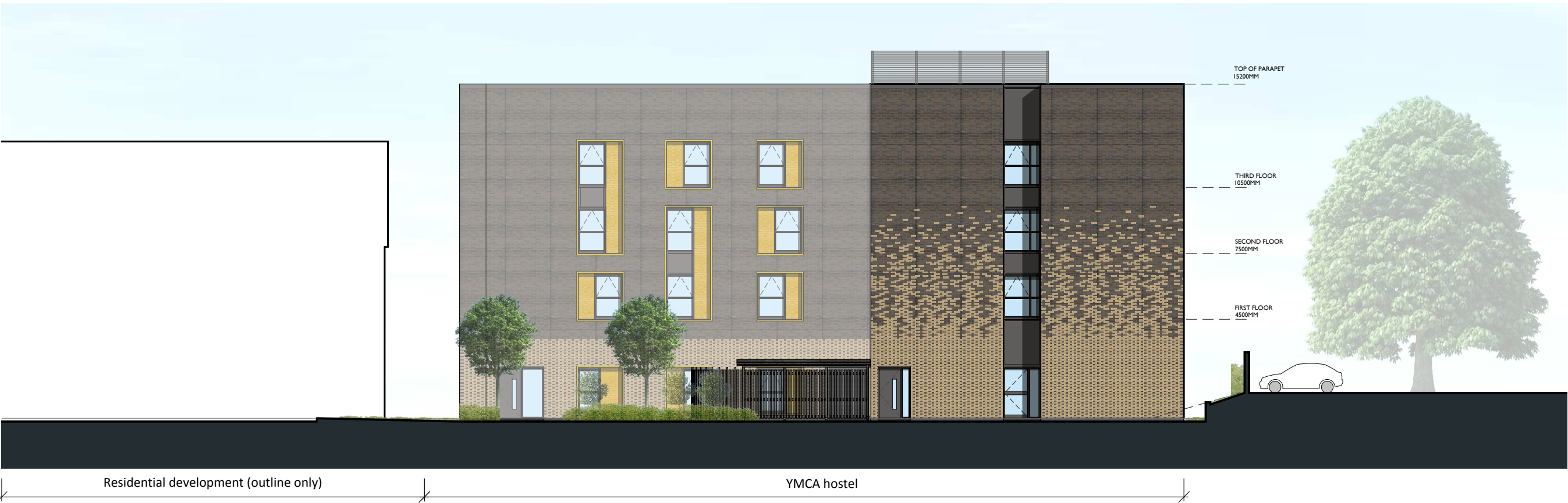
ELEVATION 2 - NORTH