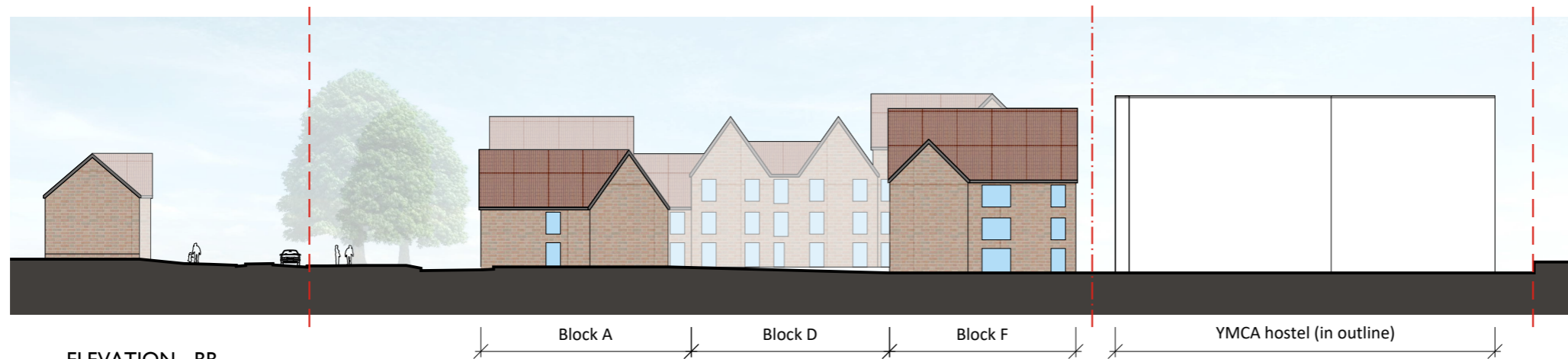
ELEVATION - BB