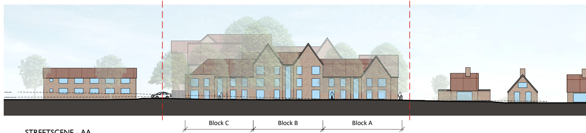
STREETSCENE - AA