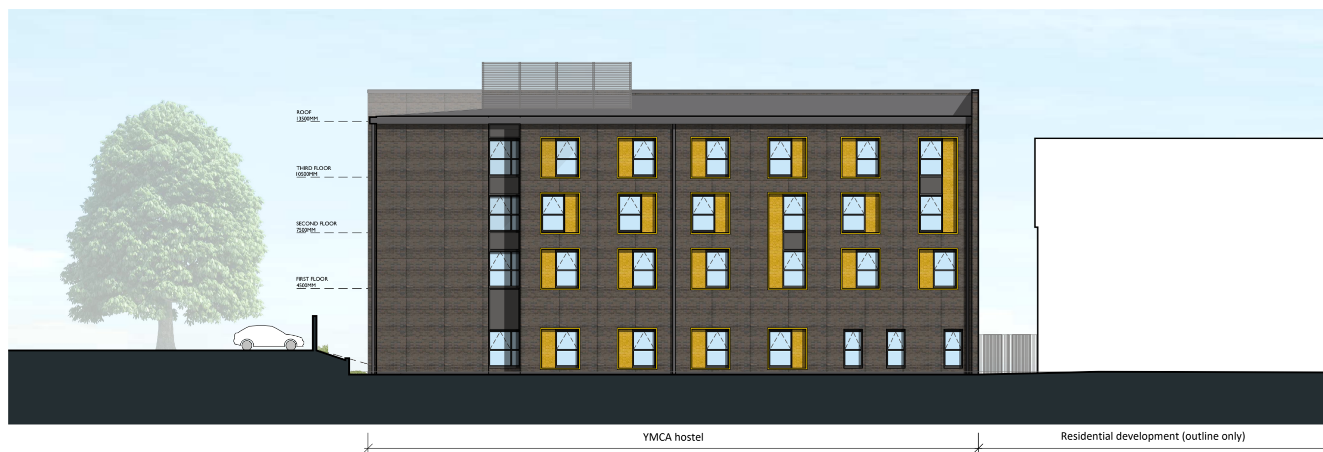
ELEVATION 4 - SOUTH