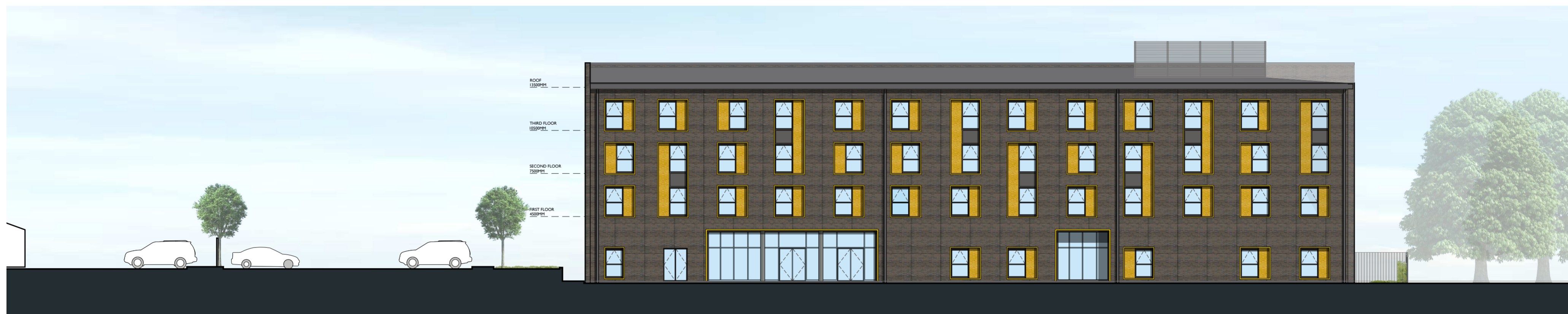
ELEVATION 3 - WEST