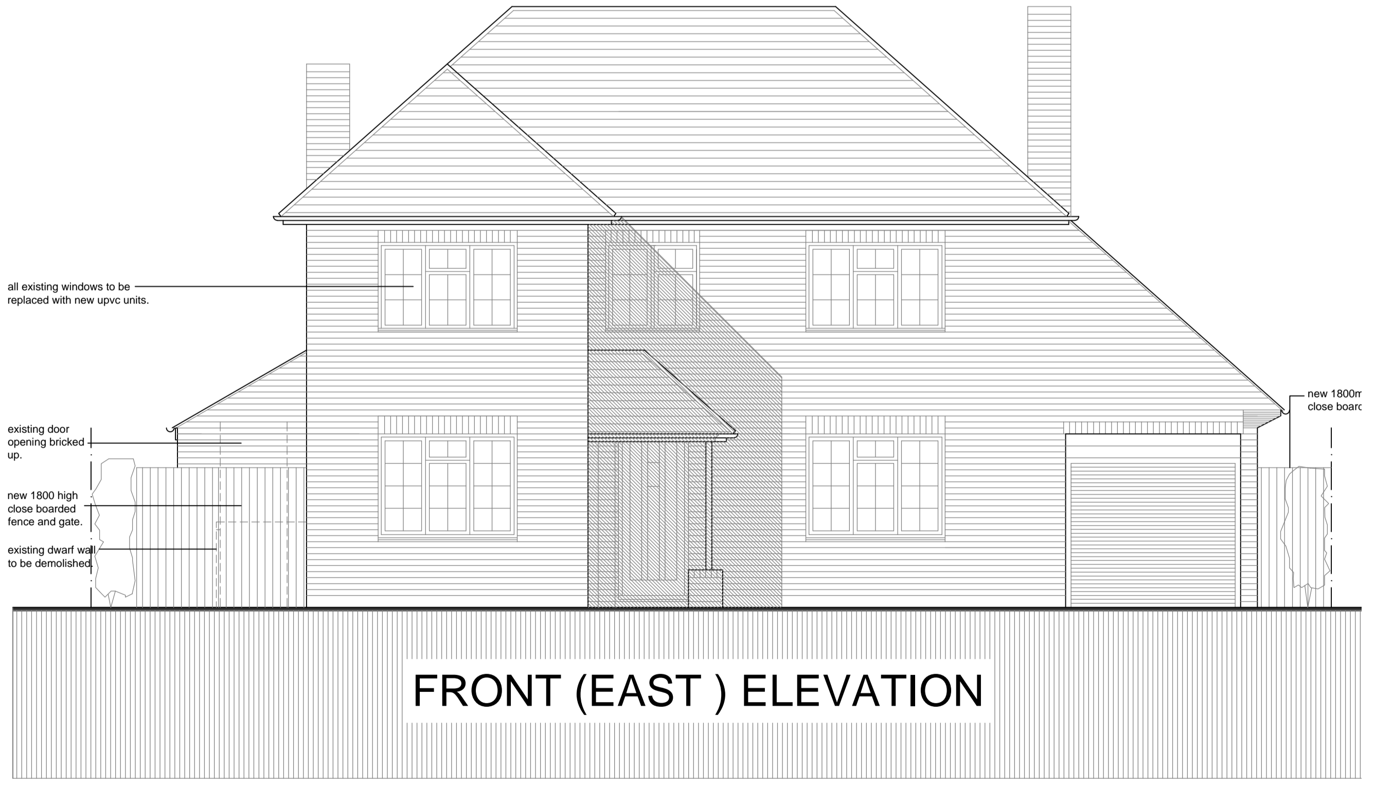
FRONT (EAST) ELEVATION