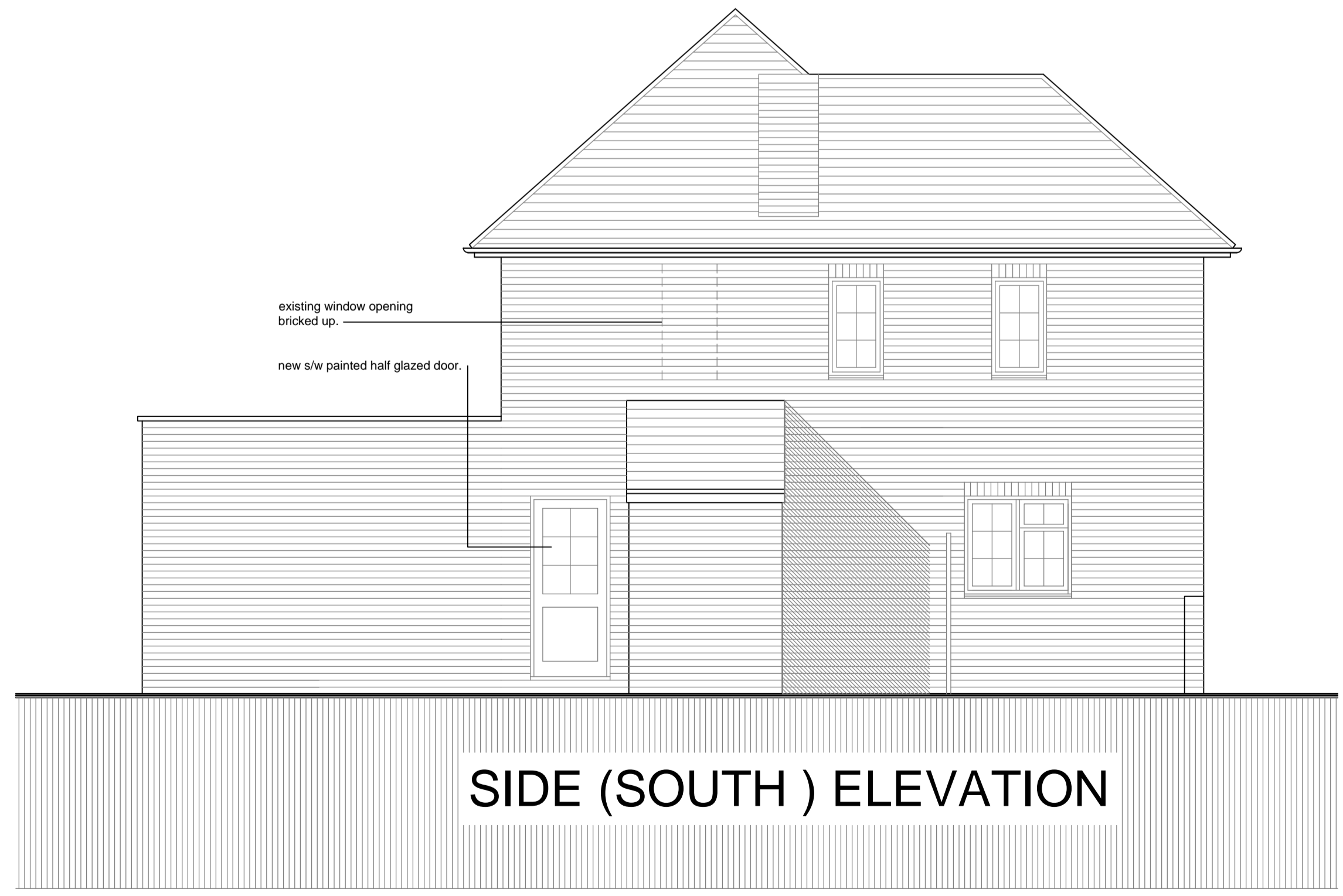
SIDE (SOUTH) ELEVATION