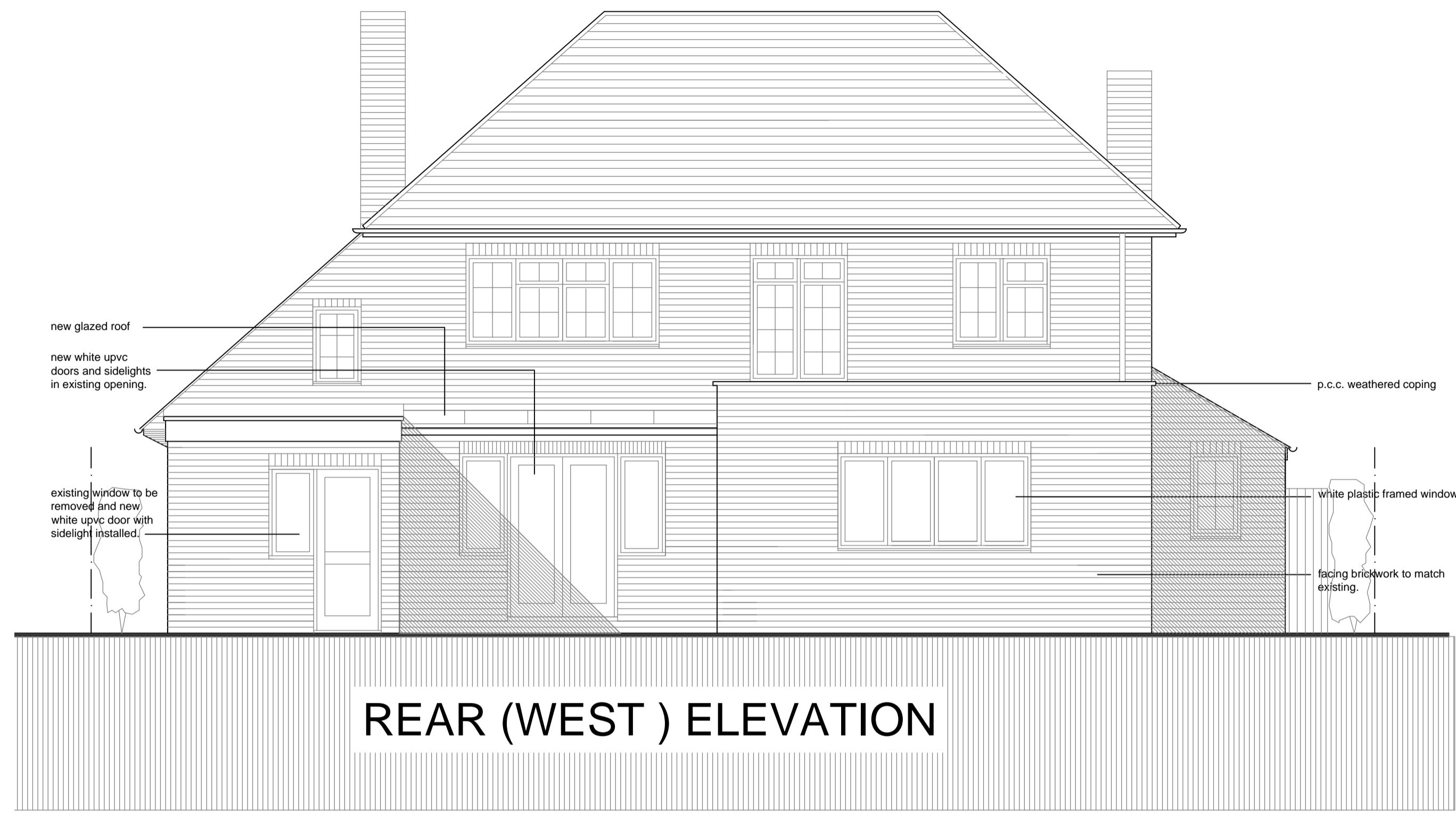
REAR (WEST) ELEVATION