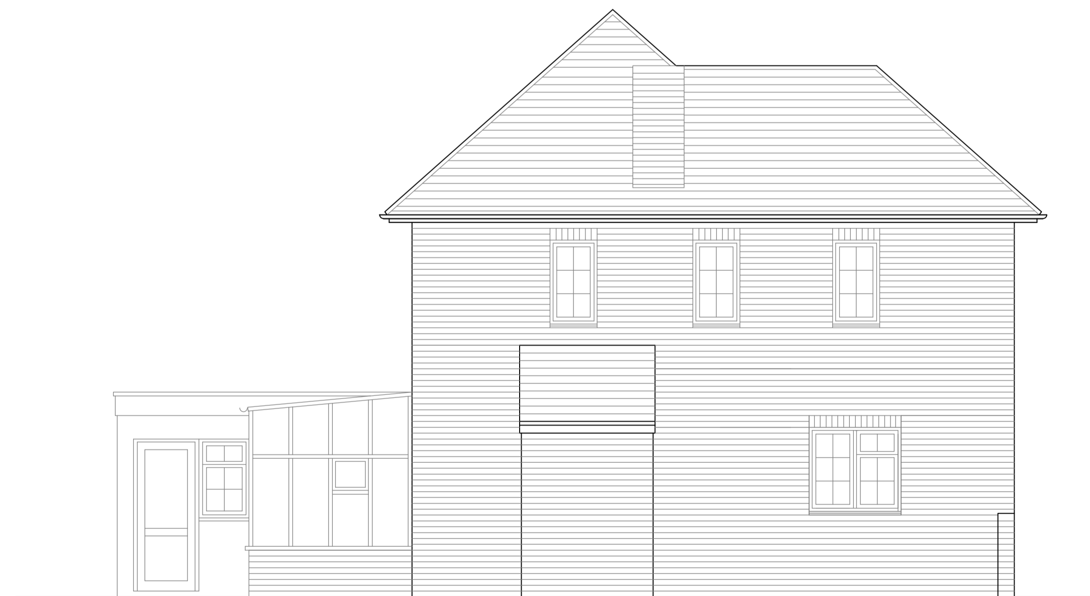
SIDE (SOUTH ) ELEVATION