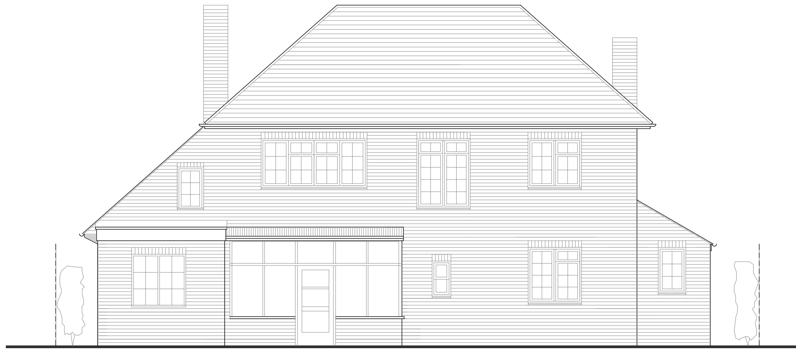
REAR (WEST ) ELEVATION