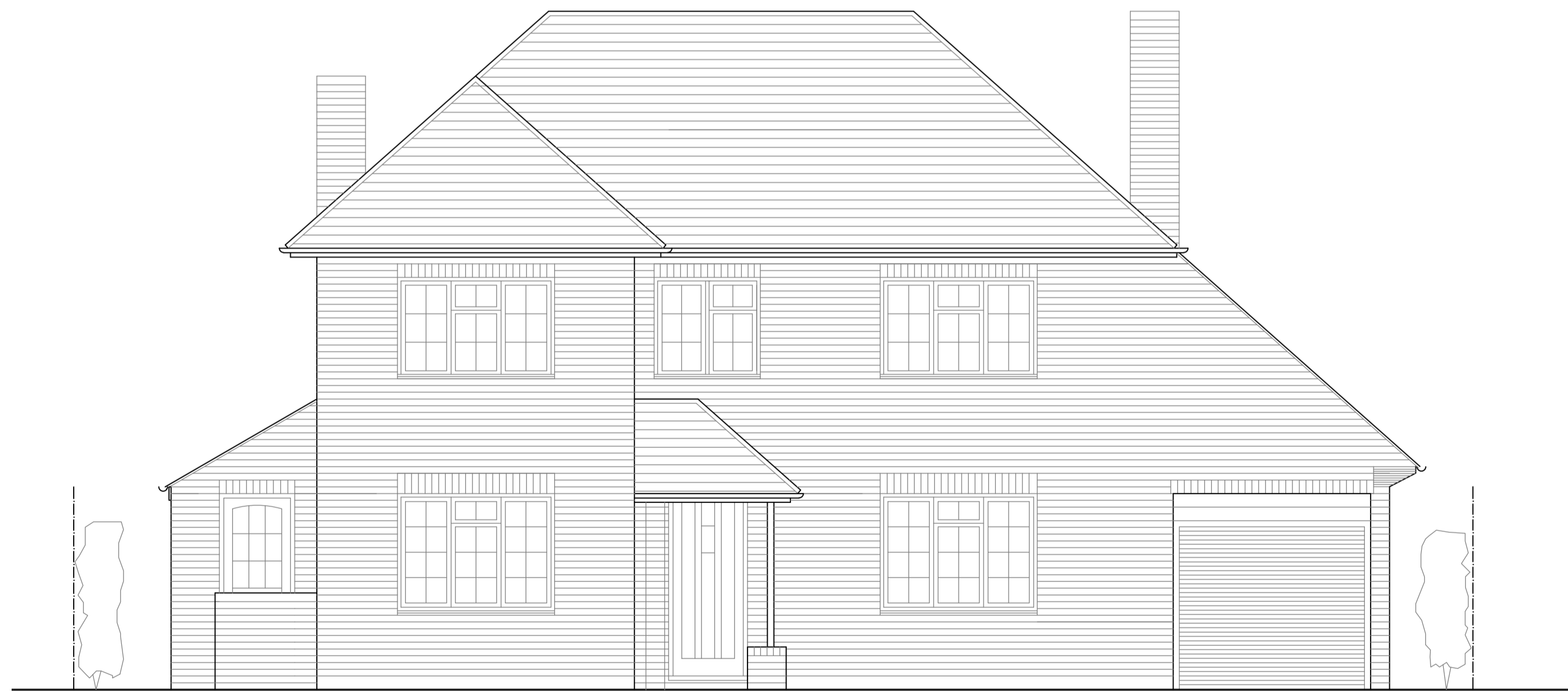
FRONT (EAST ) ELEVATION