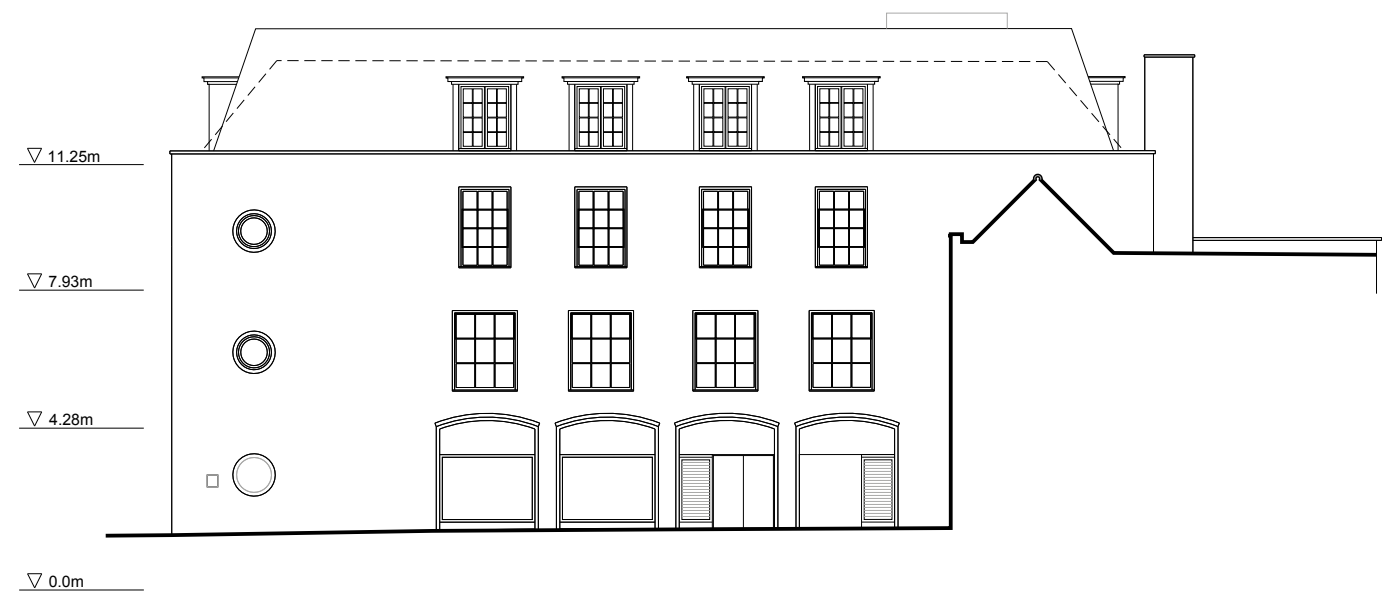
ELEVATION 3 (WEST ELEVATION)