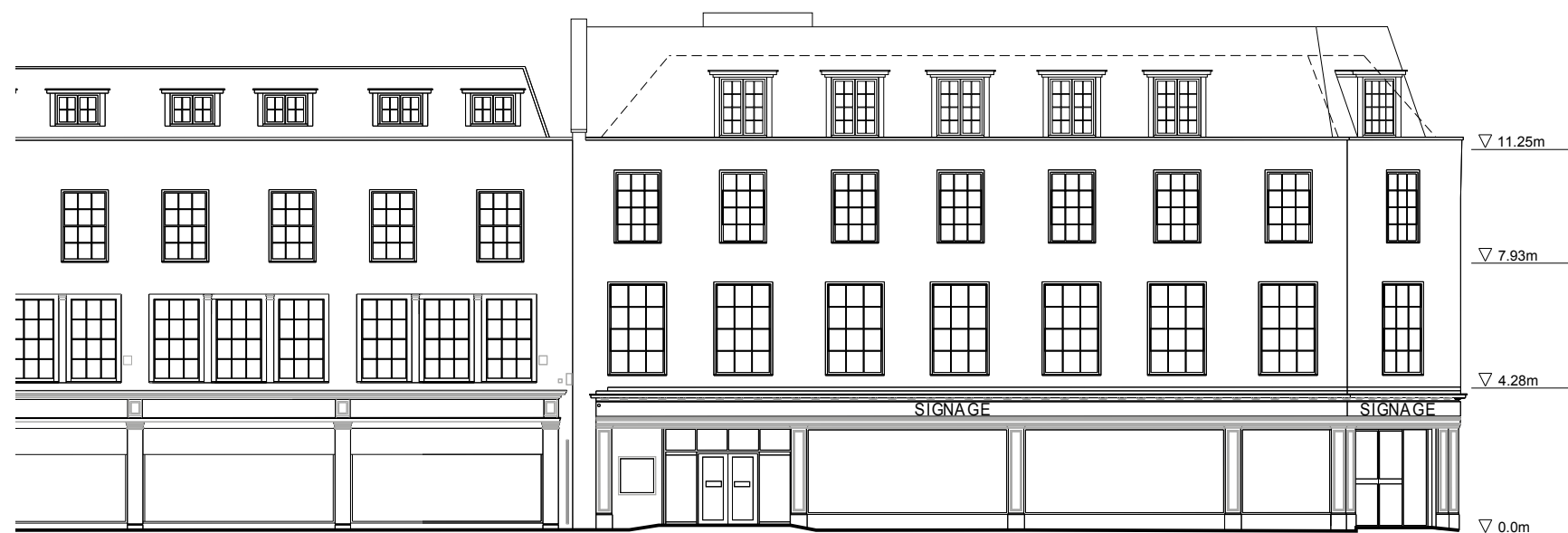
ELEVATION 1 (EAST ELEVATION)