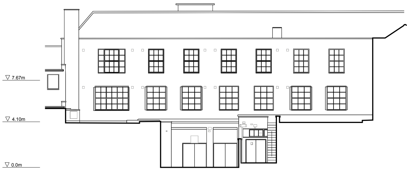
ELEVATION 4 (SOUTH ELEVATION)