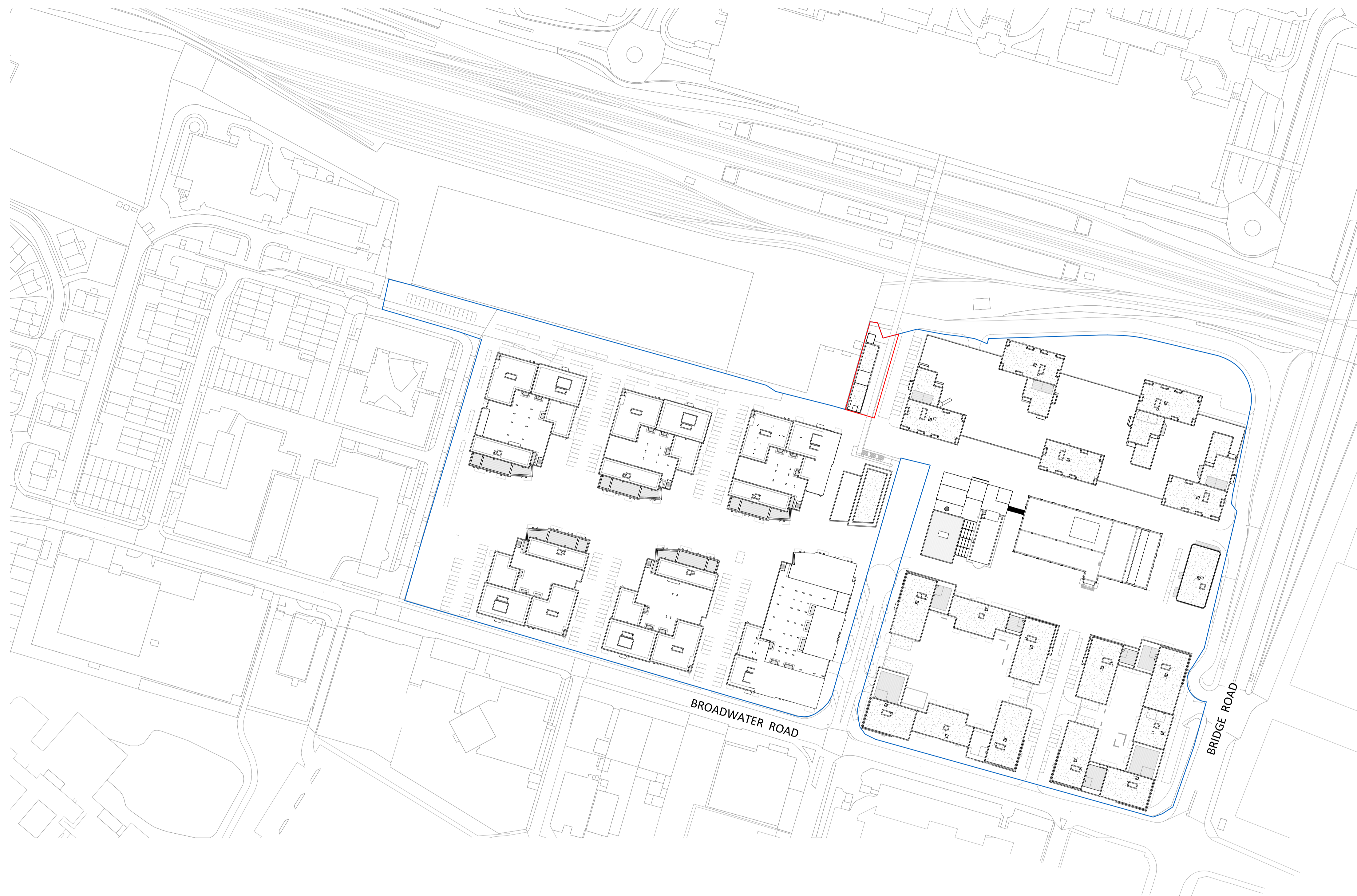
1 Site Location Plan 1 : 1250 @A1