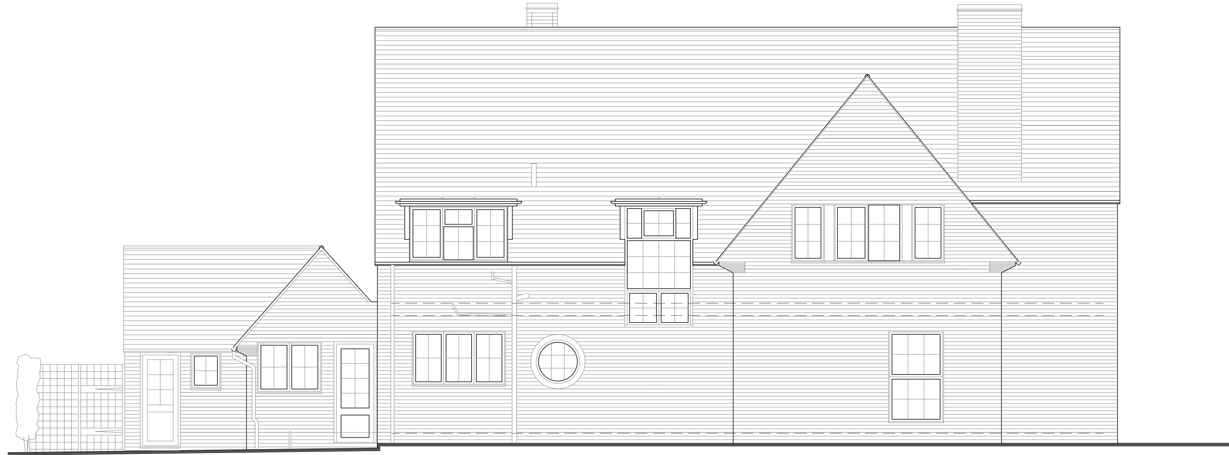
REAR NORTH WEST ELEVATION