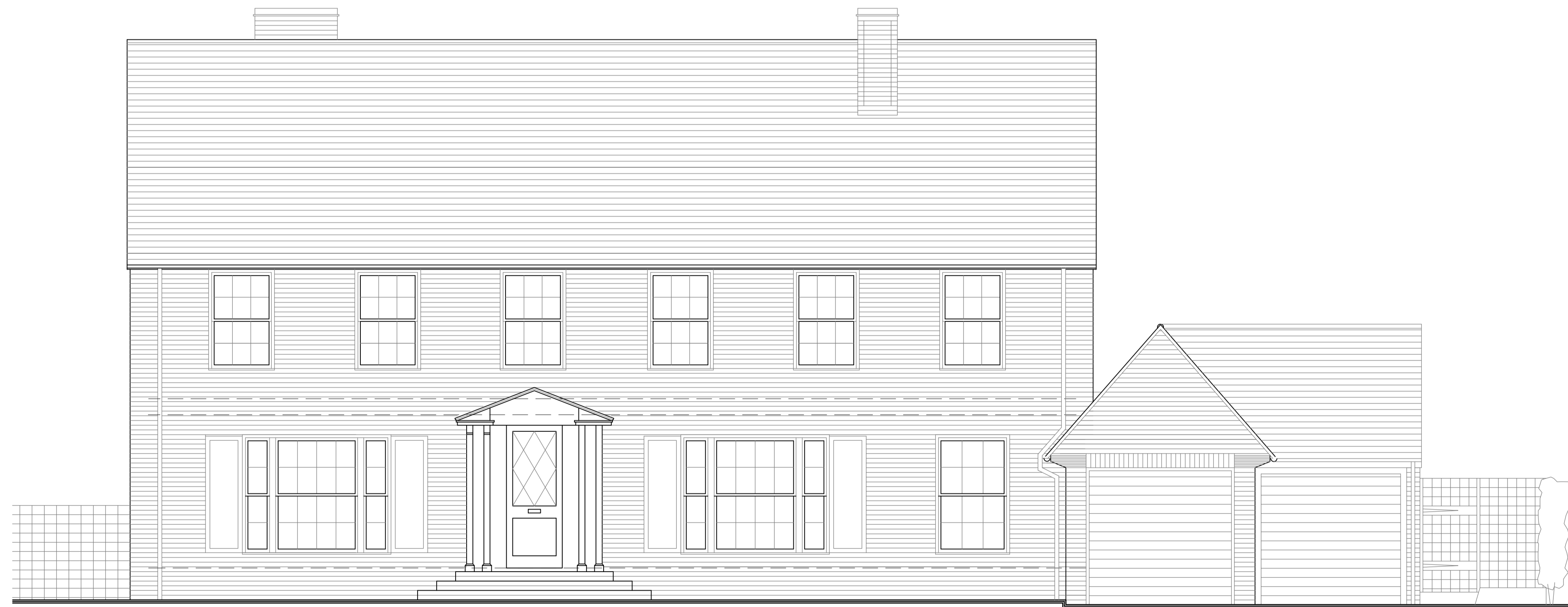
FRONT SOUTH EAST ELEVATION