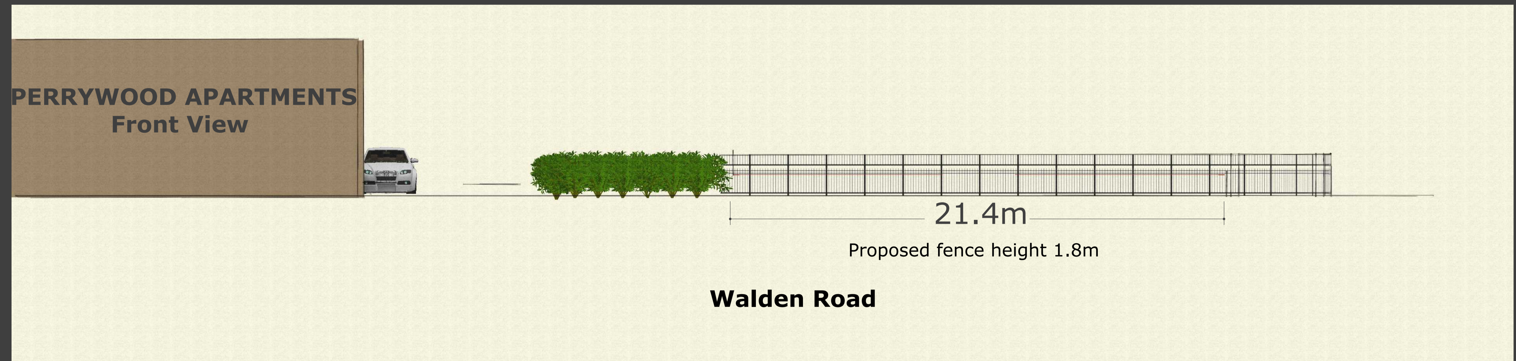
PROPOSED WEST SIDE VIEW Mesh Panel Fencing