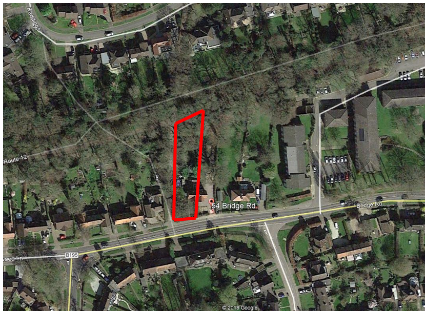
Location Plan of the application site, Bridge Road