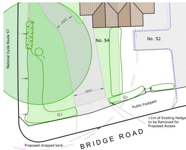
Extract of Proposed Access Showing Small Hedge Removal to Widen Access.

appropriate within the area, allowing the surface water to drain through the driveway in accordance with good practice of Sustainable Urban Drainage Guidance.