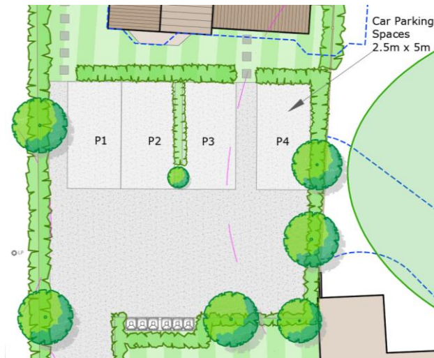
Extract of Proposed Site Plan Showing Proposed Parking