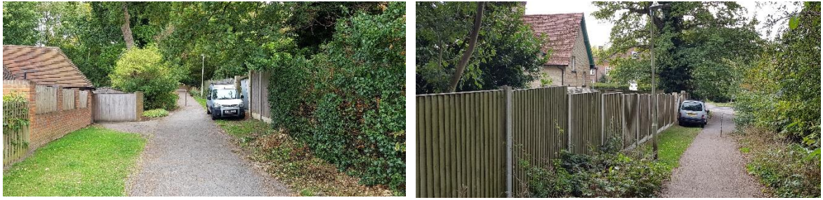
Photos - Bridleway & Western Site Boundary and Gate