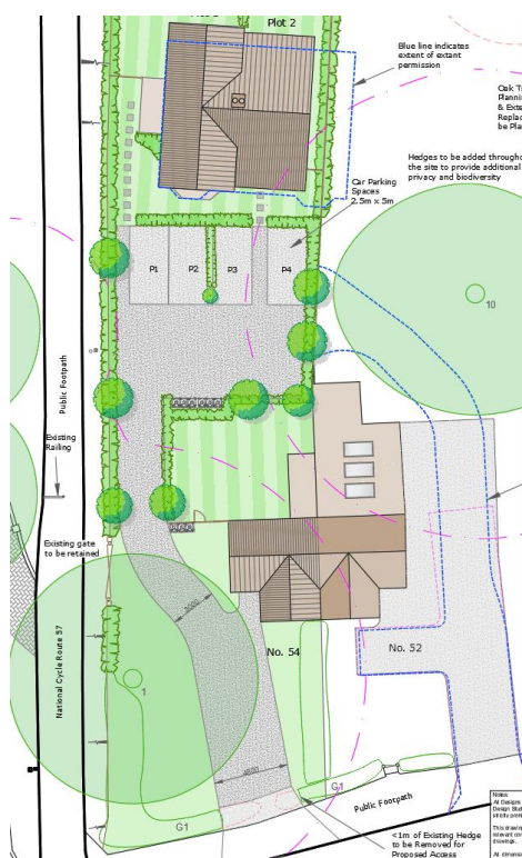
Extract of Proposed Site Plan With Outline of Extant Permission

6.1 It is the intention of this proposal to closely mimic the previously approved scheme (N6/2014/2504/FP) with few minor variations, which is to exclude the land of 52 Bridge Road. The omission of 52's land, on the face of it, sounds quite a dramatic change but, in reality, 52 Bridge Road's curtilage is severely restricted by the Root Protection Areas (RPA's) of the TPO trees on the eastern boundary and, therefore, the land could only previously contribute by providing access. 54 Bridge Road provided the majority of the developable land and amenity for the proposed houses. Thus, it is now considered that by creating access through 54 Bridge Road it is possible to recreate a variation of the approved scheme without the need to include 52 Bridge Road. The updated scheme retains equally green vistas from the public footpath as the approved scheme.