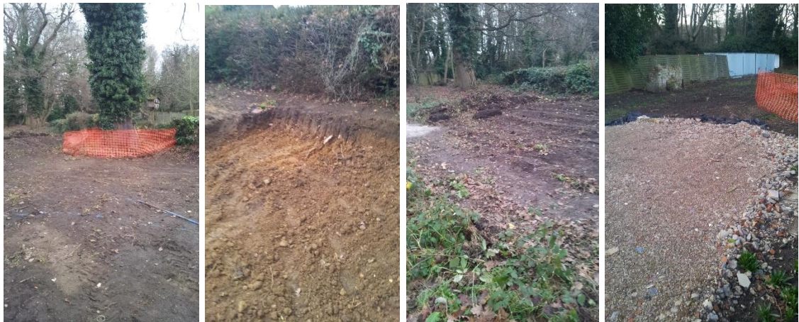
Photos - showing the construction of 52 Bridge Road Driveway adjacent to TPO Oak Tree. This drive was subsequently re-laid in accordance with the approved plans & more recently dug out again within the root protection area.