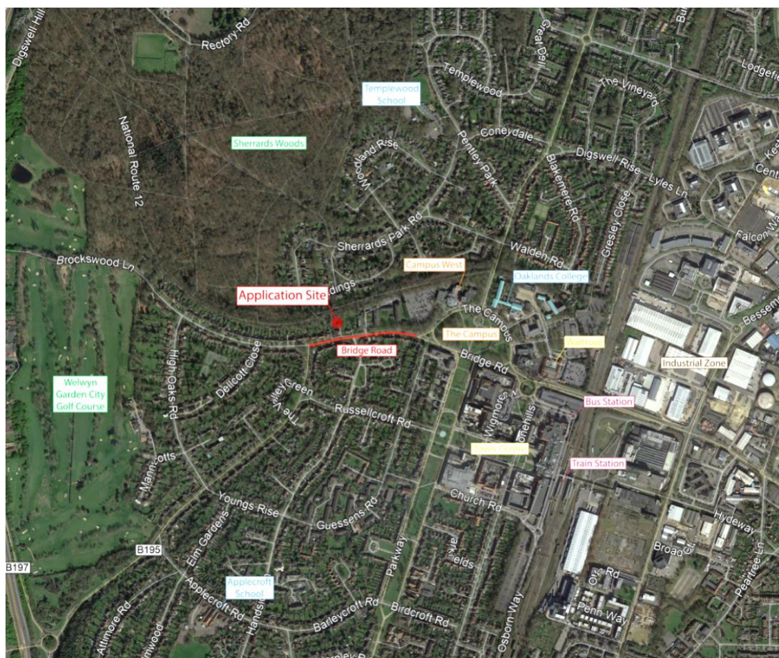
Context Location Plan

1.1 54 Bridge Road is situated on the north side of Bridge Road with the proposed development sited to the rear of the property. Bridge Road one of the earliest roads of the Garden City and as such it is a well-established residential road located to the north-west of Welwyn Garden City Town Centre. It is identified as being within the Conservation Area and, as with much of Welwyn Garden City, is also controlled via the Estate Management Scheme. The residential section of Bridge Road is a relatively short road running from the road junction of Valley Road / Brockswood Lane Junction in the west to the junction with the Campus at its most easterly.