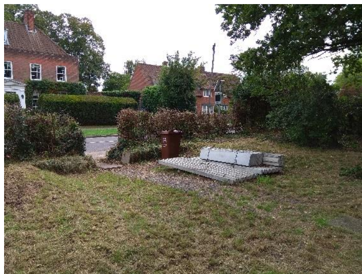
Photo of Front Garden of 54 Bridge Road