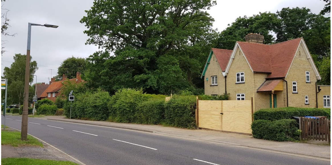
A view of 54 Bridge Road (Taken facing North West)