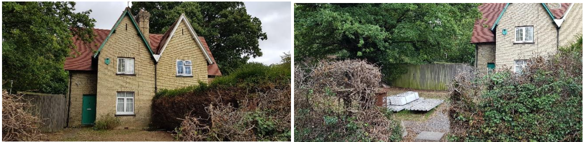
Photos – Front of 54 Bridge Road