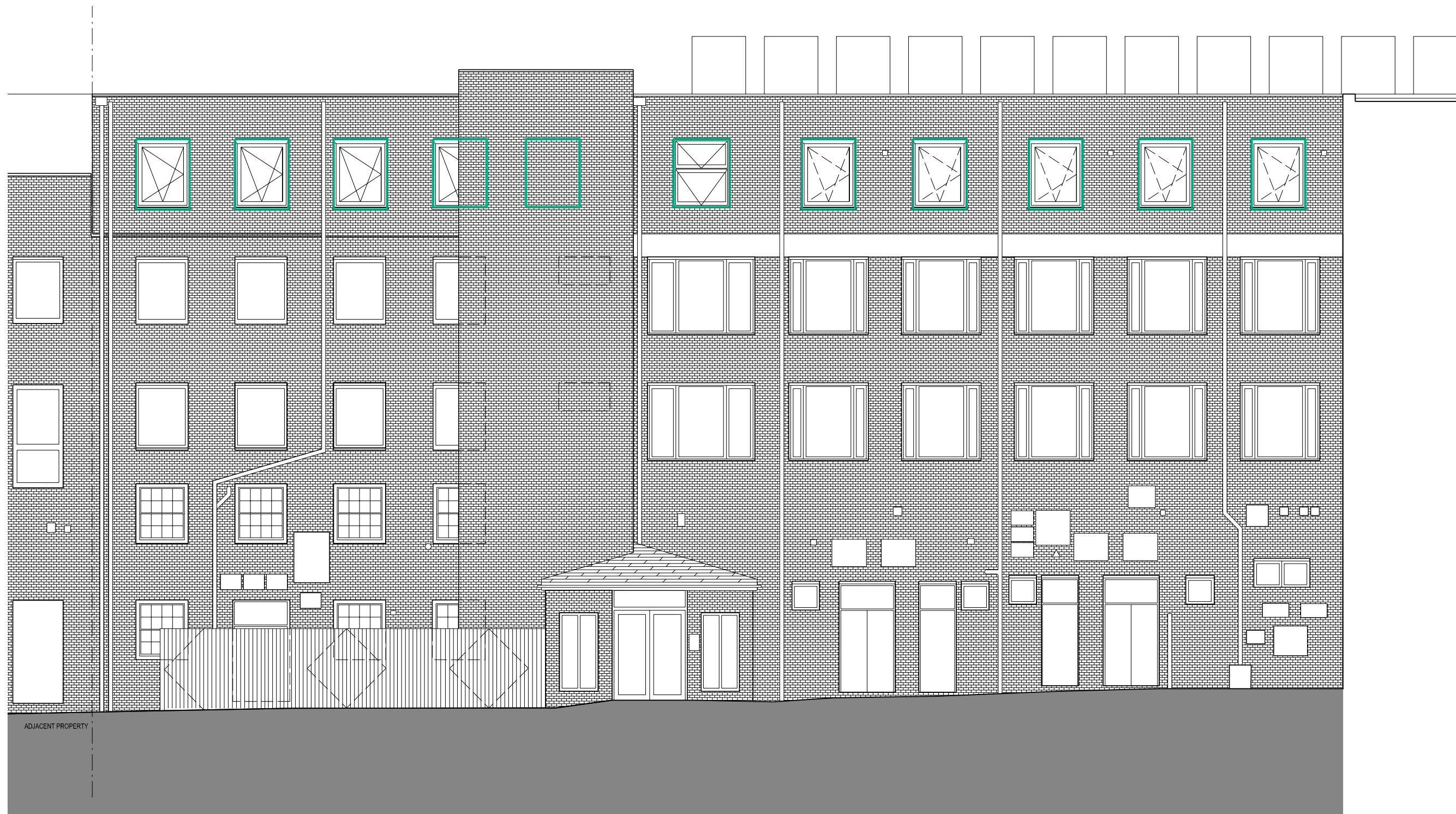
01 Proposed Rear Elevation - North 1:100@A3

PAPA Papa Architects Ltd. 222 Archway Road, Highgate, London N6 5AX Phone. +44(0)20 8348 8411 Fax. +44 (0)20 8348 7411 www.papaarchitects.co.uk