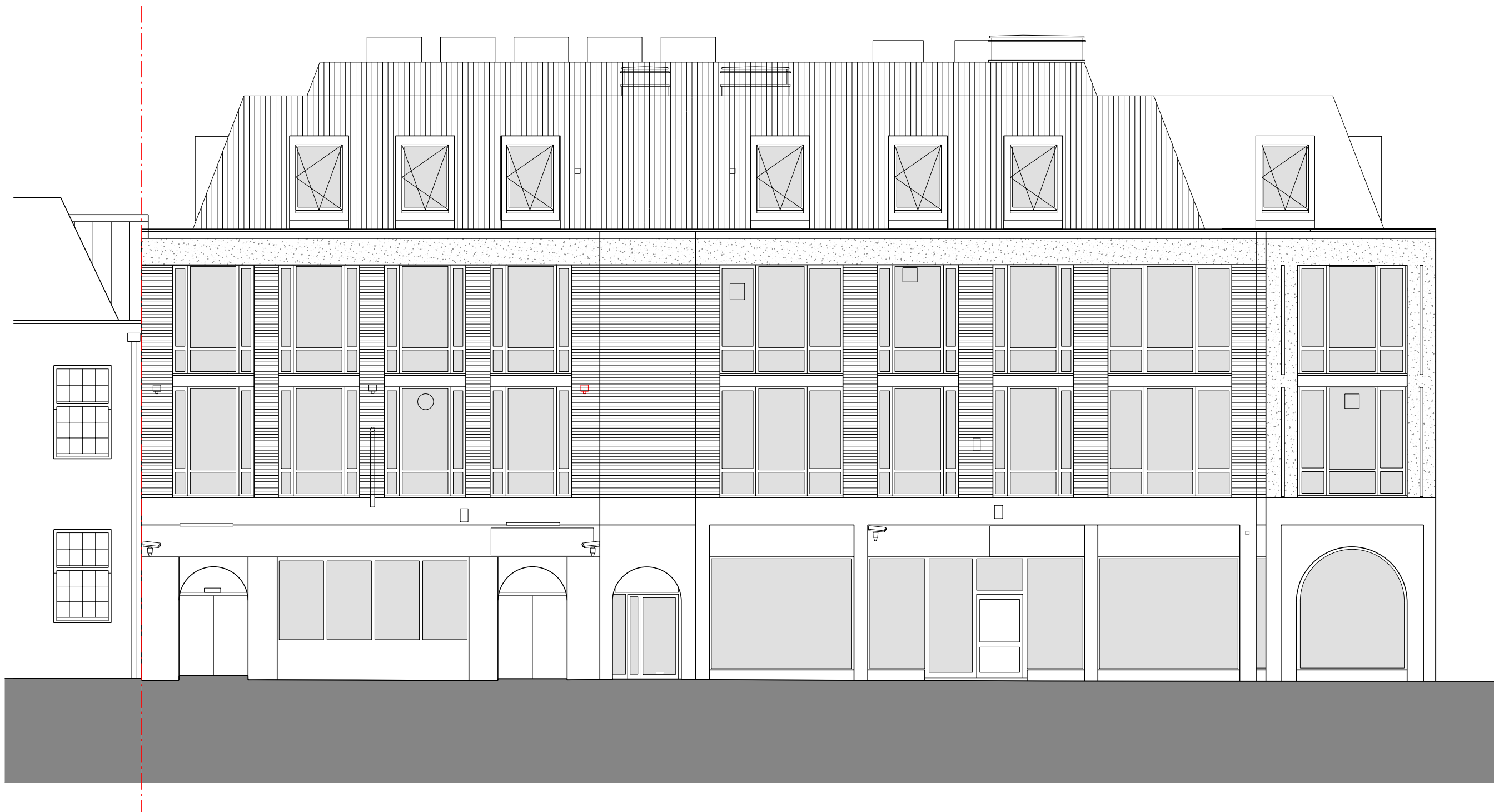
01 Approved Side Elevation - West (Parkway) 1:100@A3

PAPA Architects Ltd. 222 Archway Road, Highgate, London N6 5AX Phone. +44(0)20 8348 8411 Fax. +44 (0)20 8348 7411 www.papaarchitects.co.uk