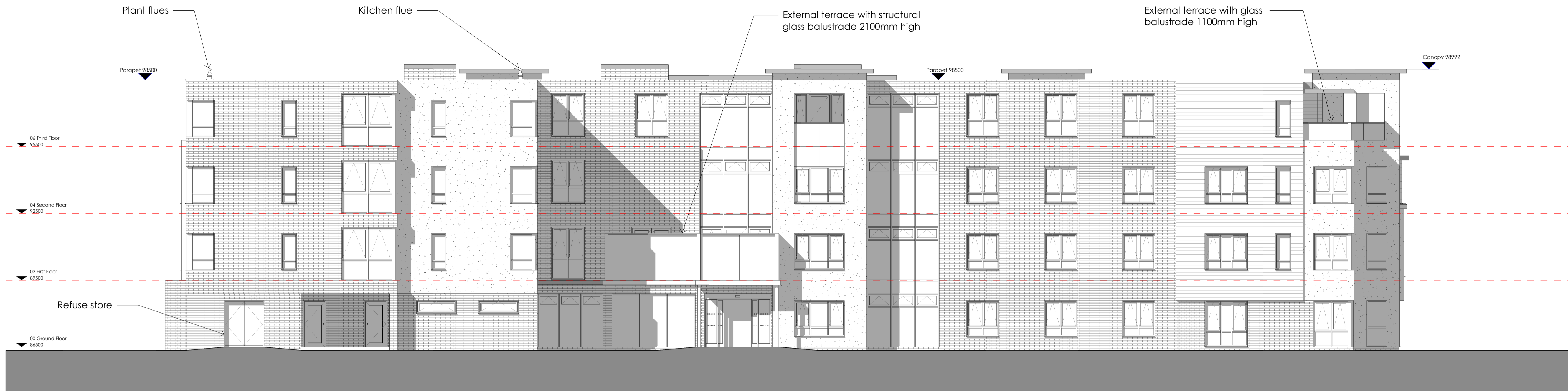
ELEVATION 1 - NORTH