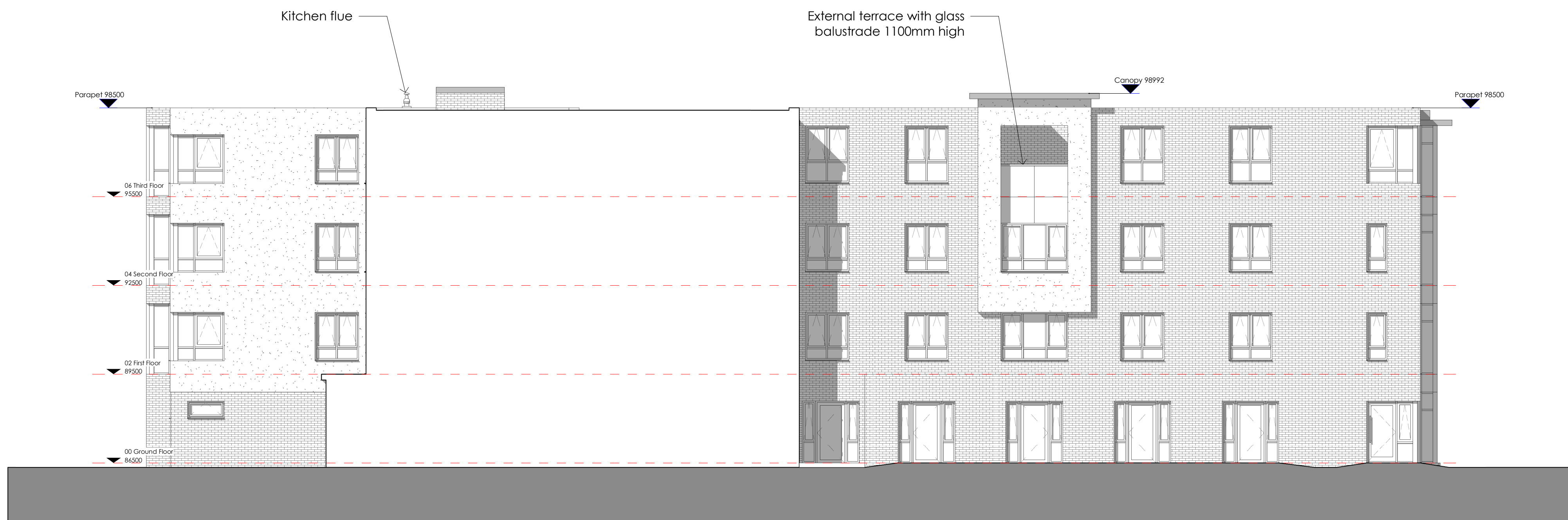
ELEVATION 6 - WEST SECTIONAL