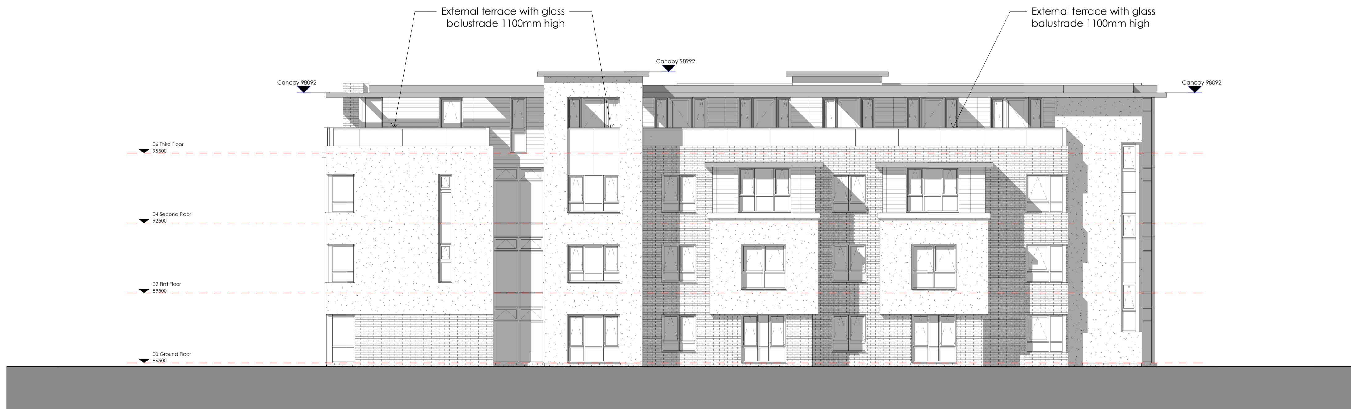
ELEVATION 2 - WEST