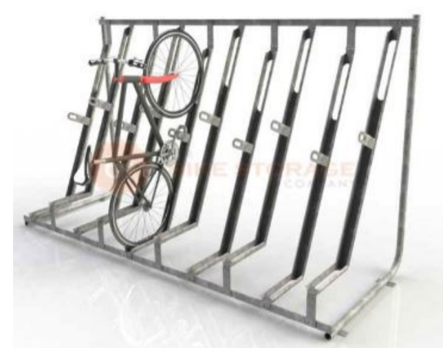
SEMI-VERTICAL CYCLE RACKS AS SUPPLIED BY THE BIKE STORAGE COMPANY